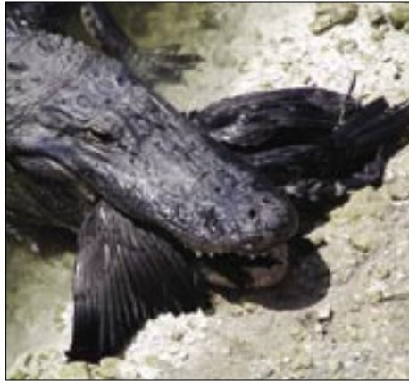
American alligator having a snack (double-crested cormorant) along the canal.

The American alligator ( Alligator mississippiensis ) is the most famous resident and adept predator along Turner River Road. They bask on the canal rims using a combination of sun and water to control their