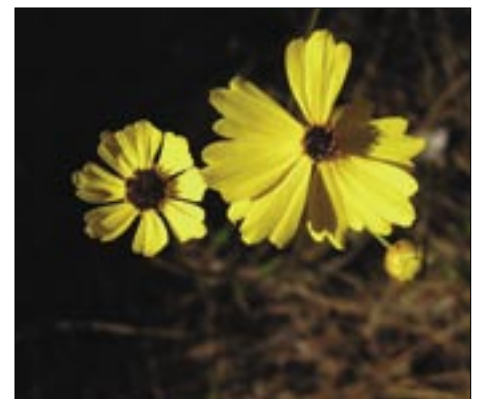
Yellow tickseed ( Coreopsis leavenworthii ) highlights several prairies along the route.

Upper Wagonwheel Road, north of Concho Billie, marks the north side of the loop. As you turn west you follow a different canal with an abundance of aquatic plants as well as the presence of tall grasses like the common reed ( Phragmites australis .) This grass is native to Florida and provides cover to wildlife. Stop a moment and listen. What do you hear? Bird calls are often heard before the birds are seen.