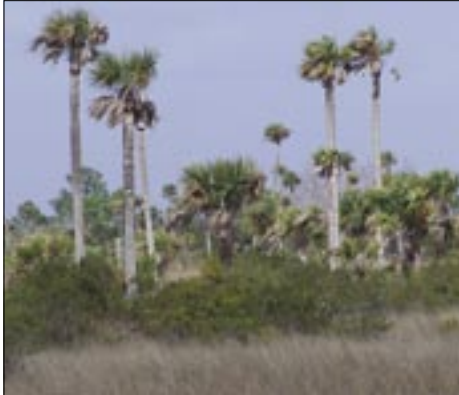
Cabbage palms rising out of the sawgrass.

The canal is only part of the beauty of this area. The sawgrass prairie borders the north side of the canal and the south side of the road. The prairie stretches for miles and offers habitat for a diversity of wildlife. Sawgrass ( Cladium jamaicense ), the dominate vegetation, has a spiny toothed leaf with edges like a saw blade.