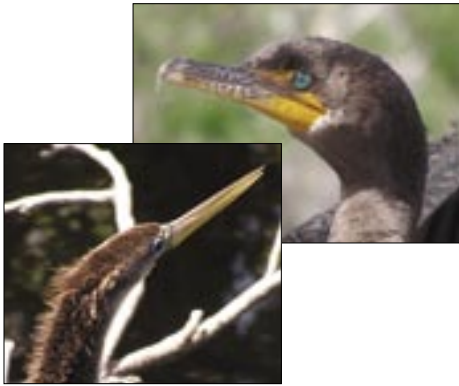
The sharp beak of the aninga, lower left, contrasts with the hooked beak of the double-crested cormorant.

a long body and pointed snout? This pointed fish is a Florida gar ( Lepisosteus platyrhincus .) When oxygen levels are low in the water, gar surface to fill an air bladder. They also prey on fish with the same behavior. Another canal resident, with an almost “bug-eyed” appearance, a red-ringed eye on the tail and black stripes is known as the oscar ( Astronotus ocellatus .) The oscar was one of the first exotic fishes reported in the 1950s and is a popular sport fish today.