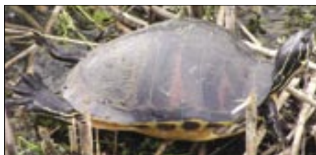
Red-bellied turtle basking.

Another reptile, which often maintains its own safe distance, is the red-bellied turtle ( Chrysemys nelsoni .) Contrary to what the name implies, the bellies are not always red; the back of the shell has red blotches. These turtles may be seen basking on rocks or resting at the surface of the water and will frequently jump into the water or dive if you approach. Red-bellied turtles eat some insects, but are largely herbivorous, feeding on aquatic plants.