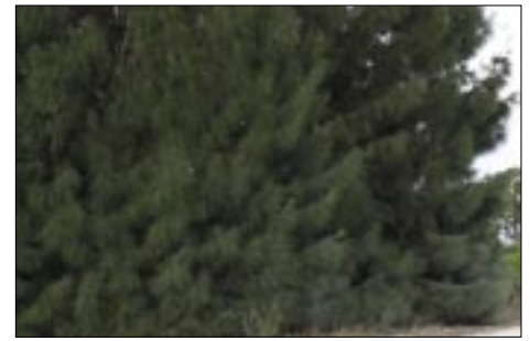
Australian pines are so dense they shade out any plants beneath them.

Take a moment and look to the west, and you may notice a small group of dense trees near the road. The Australian pine ( Casuarina equisetifolia ) is not a true pine nor a native to Florida. Historically planted as a windbreak this non-native (exotic) is currently under control in the Preserve but other species thrive in this sub-tropical environment, though they do not have a natural place. Some are