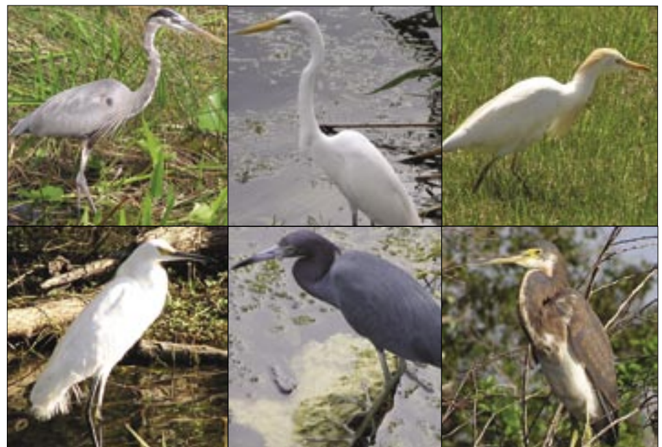
Wading Birds of Big Cypress National Preserve. Top (left to right) great blue heron, great egret and cattle egret. Bottom (left to right) snowy egret, little blue heron and tricolored heron.