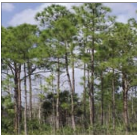
Slash pines tower over a Cabbage Palm.

is equaled by the splendor of the pinelands to the south. Slash pines ( Pinus elliottii var. densa ) reign as the native pine in Big Cypress National Preserve. The name slash is derived from the method of extracting resin from the trees by scoring or slashing to start the flow. This historic process was employed to extract resin for use in the production of turpentine. The resin continues to be extracted today but not by human hands. The beak of the red-cockaded woodpecker ( picoides borealis ), an endangered species, penetrates the bark to start resin flow. To protect young, they nest in live pine trees where resin flow creates a sticky situation for would-be predators of chicks. Pines provide homes for some and resting places for others.