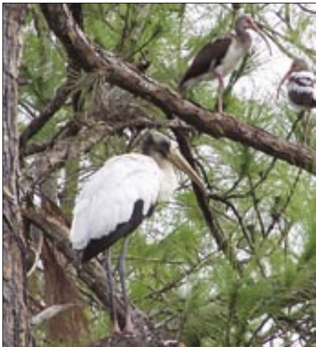
Wood stork (foreground) and immature white ibis resting in a slash pine tree.

Getting the most from your bill doesn't just apply to the dollar. As adults, the white ibis ( Eudocimus albus ) display a white body and brilliantly orange beak with a noticeable downward curve. The immatures have brown wings. These birds forage in the ground and water, using their beak like a needle of a sewing machine. Each stitch probes the ground, providing an opportunity to capture aquatic insects, crustaceans, small fish or amphibians.