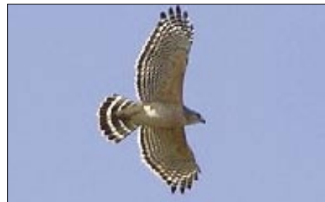
Red-shoulder hawk soaring.

Watch the skies for red-shouldered hawks ( Buteo lineatus ) soaring overhead. They use keen vision to locate small mammals, reptiles, and amphibians to eat. They perch in pines to feed and to rest.