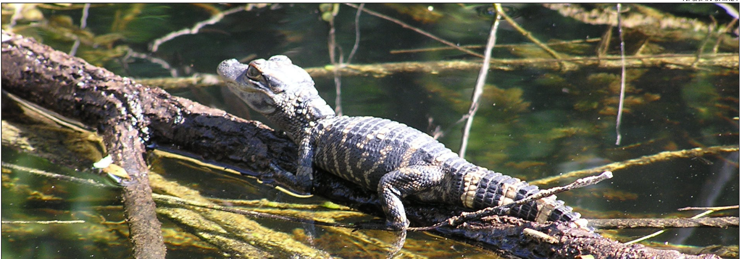
A juvenile alligator takes in some sun on a branch.