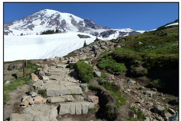
Trail & meadow in need of rehabilitation in Paradise

Based on this analysis, the park will develop an implementation plan towards accomplishing the twin objectives of restoring the meadows and providing adequate trails for people to continue to walk and hike in the area. While planning begins, some trail work that is necessary to maintain existing access and long-planned meadow restoration activities, will also occur. Some of this work is funded through federal appropriations, some through entrance fee funding, and some from private philanthropy through Washington's National Park Fund. Once the park develops a phased implementation plan additional funding will be sought.