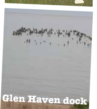
Glen Haven dock