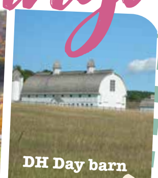
DH Day barn