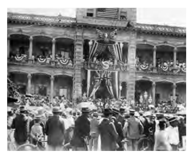
Crowd in front of 'Iolani Palace, circa 1900.

War II was a watershed for Asian Americans politically, as for the second time in the U.S. an Asian ethnic group was singled out for the denial of civil rights. This time it was Japanese Americans, who were forced to leave their homes and farms on the west coast, including Hawai'i, interned in isolated camps with few political rights, and guarded by the military throughout the war. During this same period, the U.S. government eliminated the exclusion of Chinese American labor as part of its war efforts against Japan, with no apology or acknowledgement of the harm it caused.