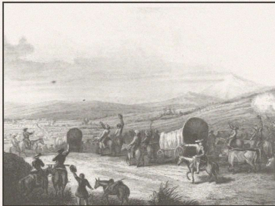
"Arrival of the Caravan in Santa Fe," lithograph, 1844.

and _____ they will get for their wares in Santa Fe. noun