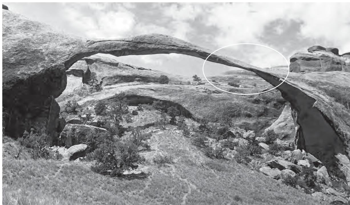
Landscape Arch in the 1950s. Oval indicates area from which rock fell in 1991. Compare this photograph with the slope under the arch today. Notice the numerous foot paths under the arch in the photo, caused by people walking off the trail. These "social trails" kill vegetation and invite erosion of the desert landscape. Since the trail under the arch has been closed, the vegetation is slowly recovering.

Landscape Arch, one of the world's longest stone spans, stretches 306 feet (93 m), yet is