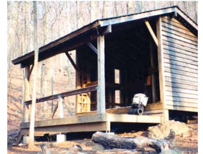
Paul C. Wolfe Shelter