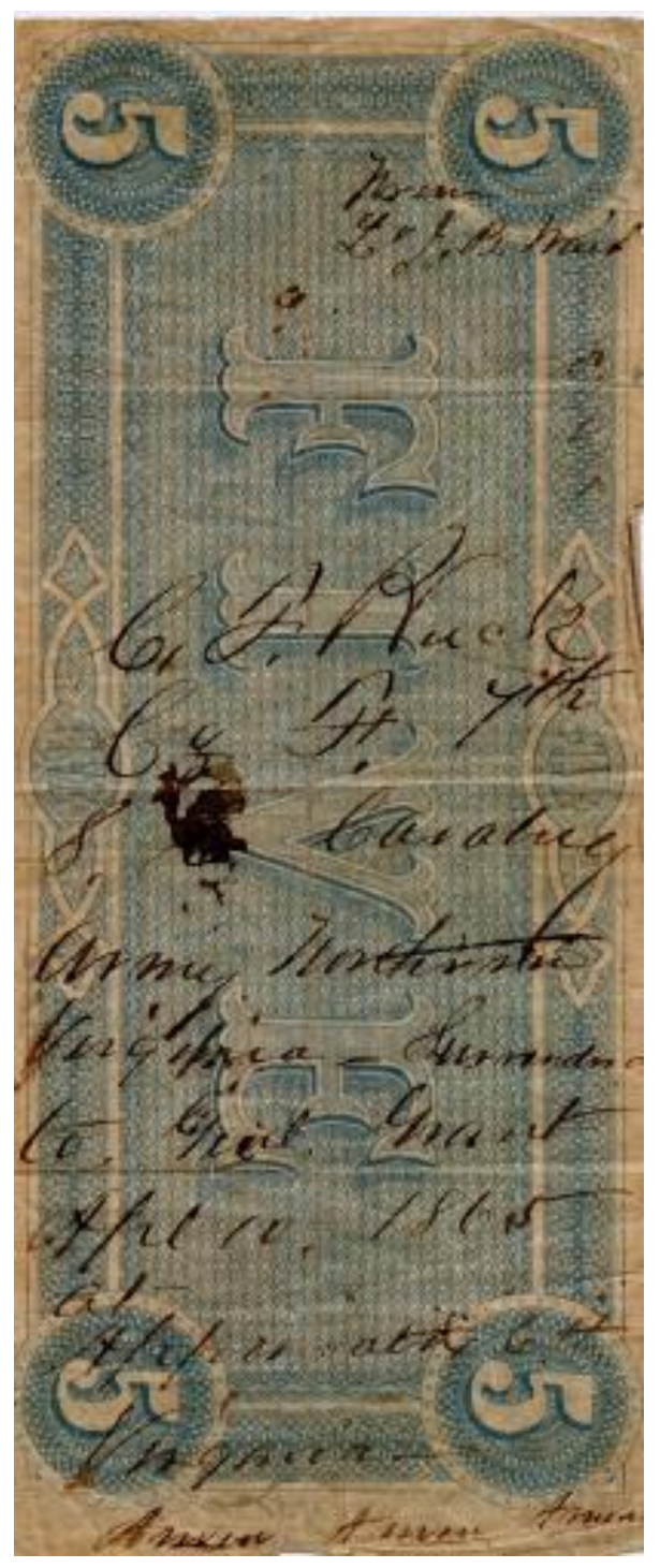
APCO 4020-01 Ruck Parole Pass on CSA Five Dollar Bill