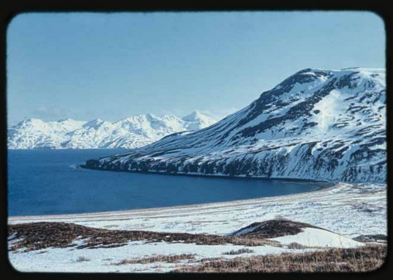
Ugadaga Bay.