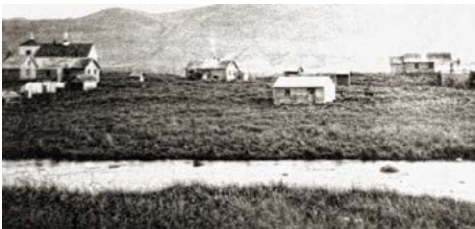
Kashega Village as seen from across the creek.