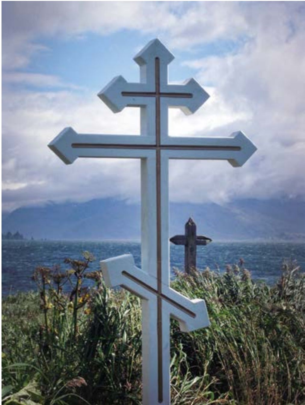
Old and new cross at the site of the former chapel at Makushin, August 31, 2009.