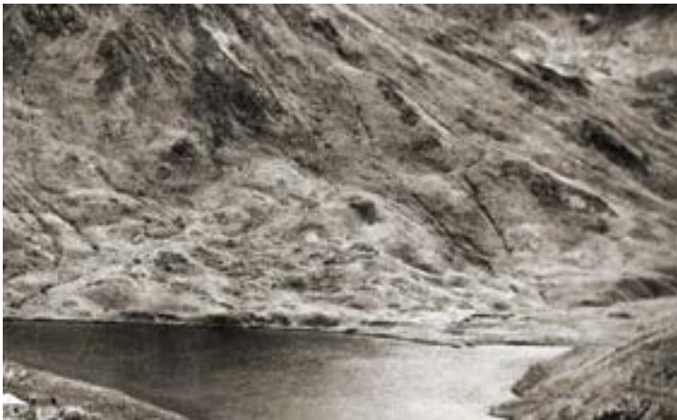
Biorka prior to World War II.