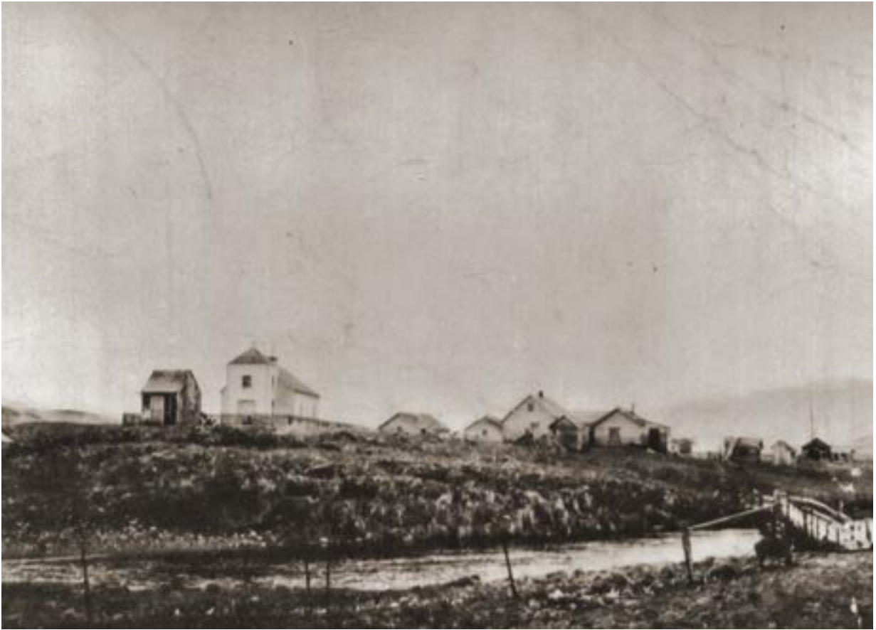
Kashega Village.