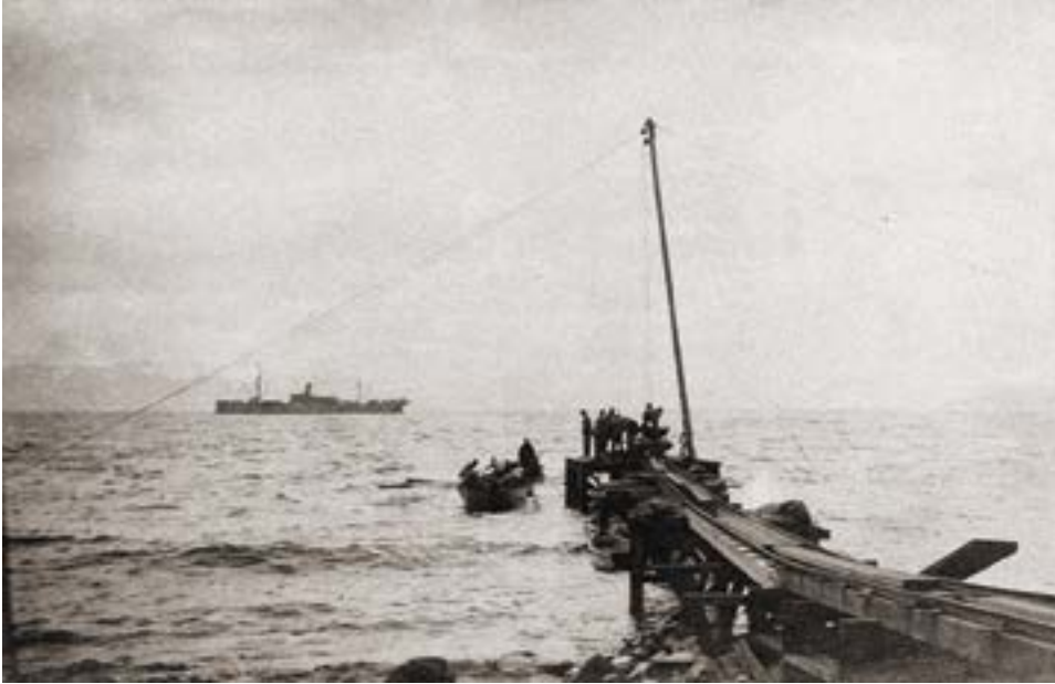
The wharf on Unalga, with the USS Nero, 1912. This wharf replaced the first that was destroyed in a storm.