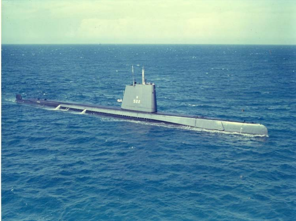
USS Amberjack, ca. 1970.