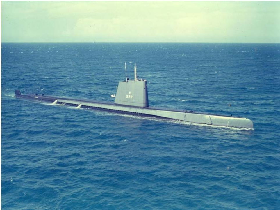
SS Amberjack, a. 1970.