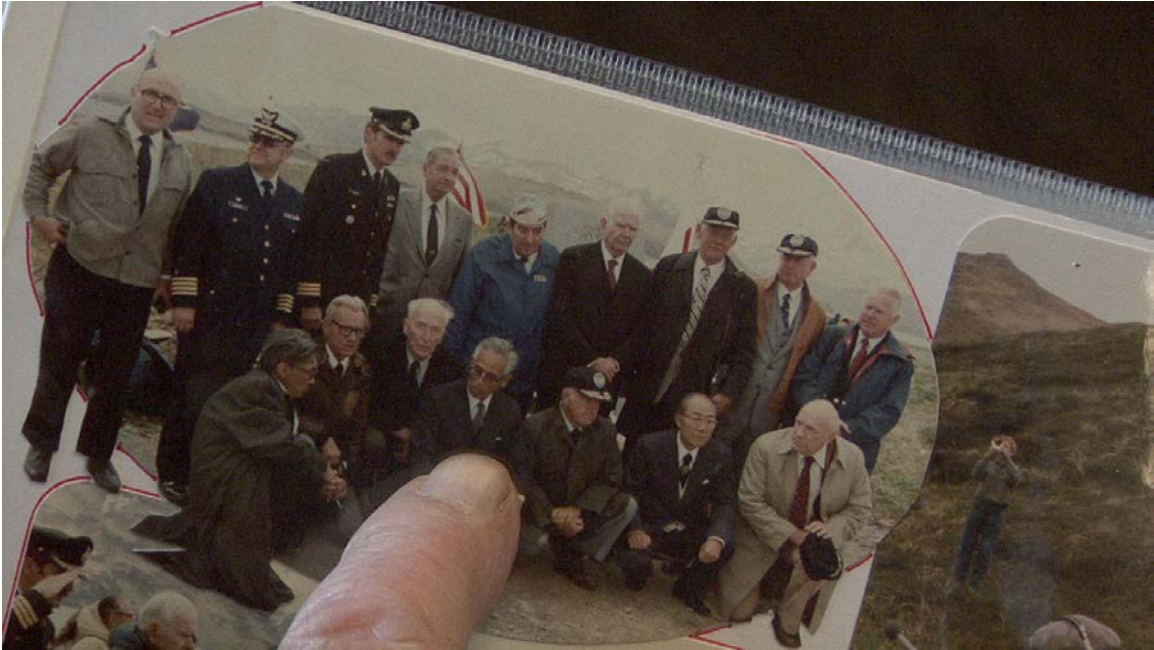
Dutch Harbor, 40 year reunion, June 1982.