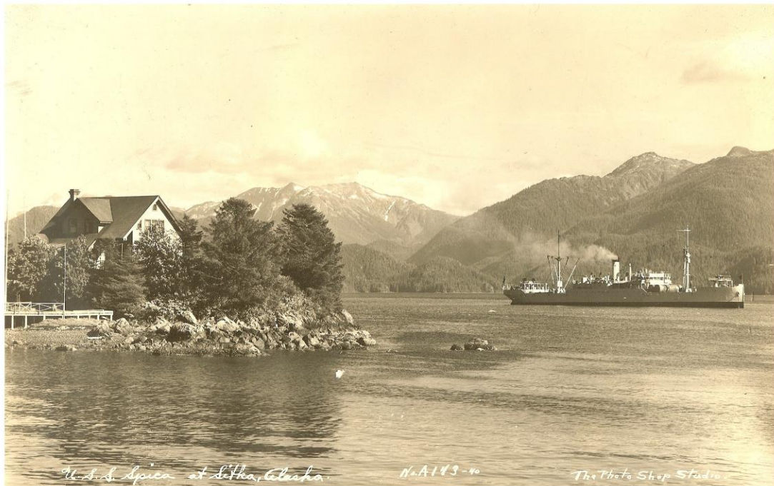
U.S.S. Spica at Sitka, Alaska.

I was a Radioman Third Class, and our assignments were making trips up to Sitka and Dutch Harbor and Kodiak, and up through the Aleutian Island area and taking supplies back and forth from Bremerton to there - to the naval bases.