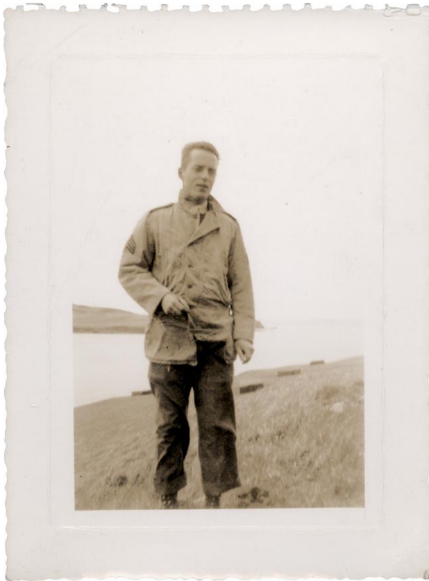
Artillery.