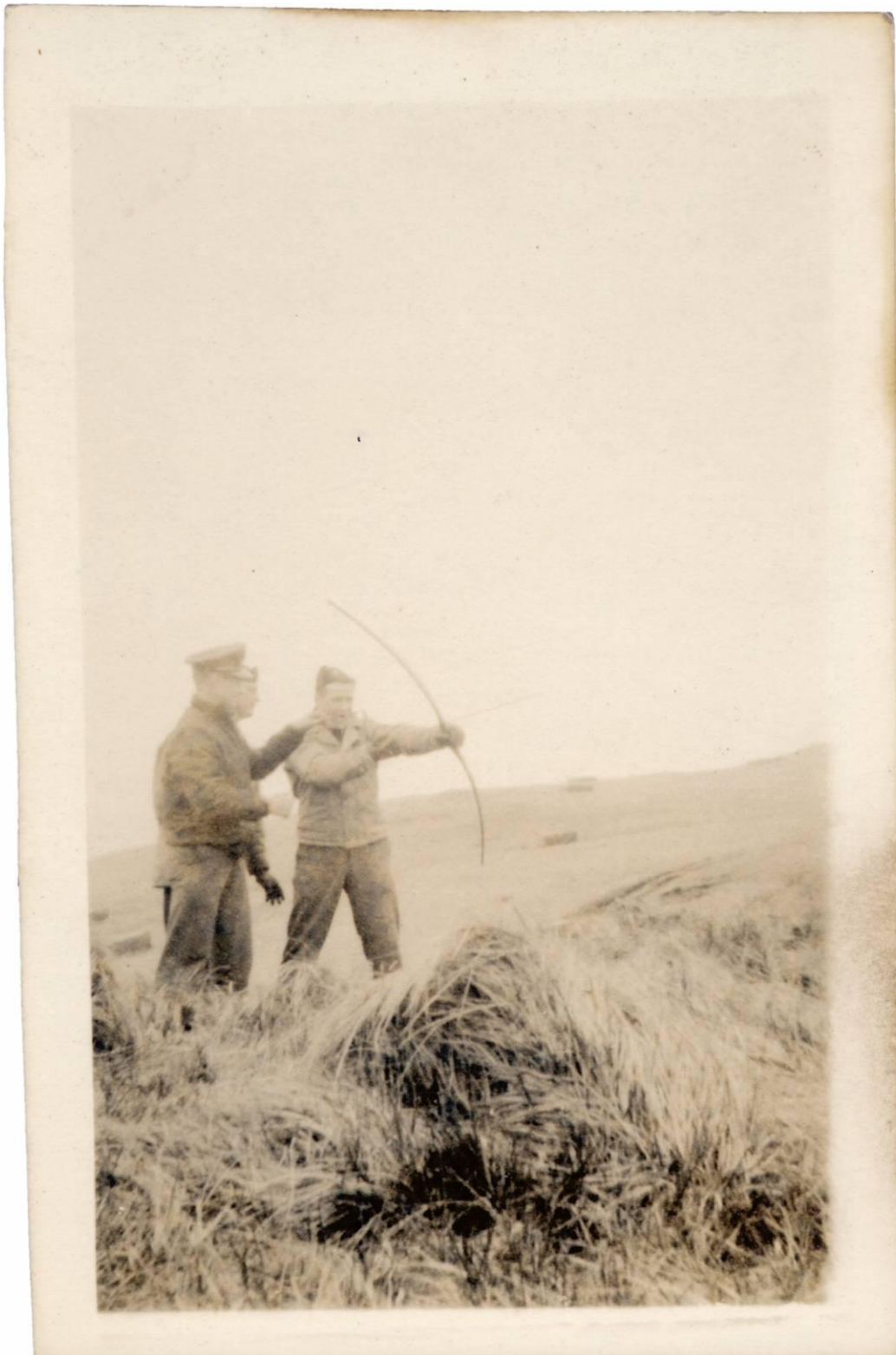
A bit of recreation on Umnak Island.