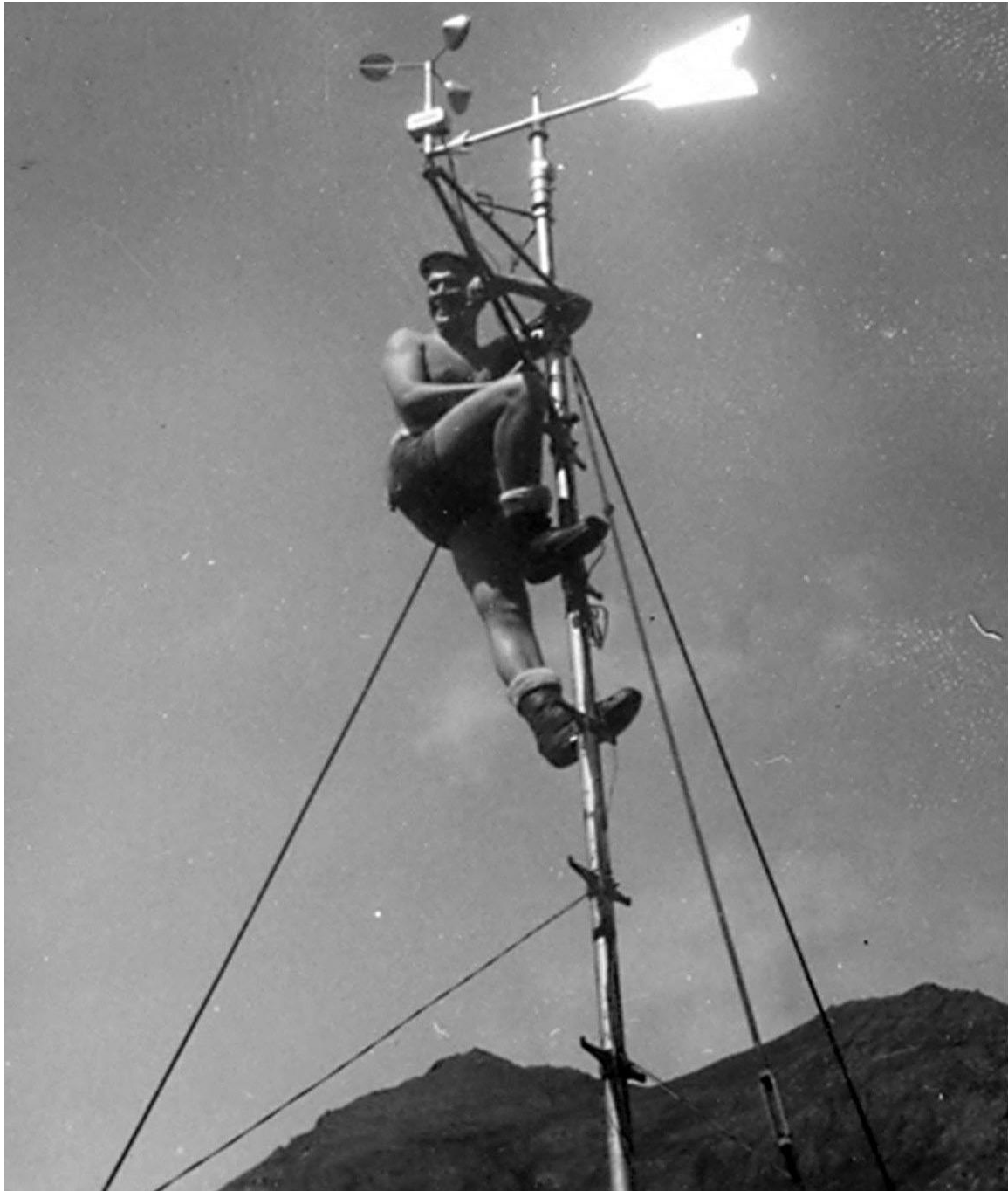
Photo 5: Andy Andersen, 1944, checking the weather! Aerological station at Cape Wrangell, Attu Island, Alaska.