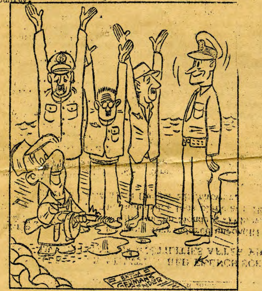
"They want to know it THEY can celebrate X-Day by shaving their mustaches and buying some Navy War Bonds!"

Cancel that Bond pledge? On the contrary! Stay with it - increase it if you can --! For the nearer we dr w to Victory - the nearer we draw to readjustment and opportunity