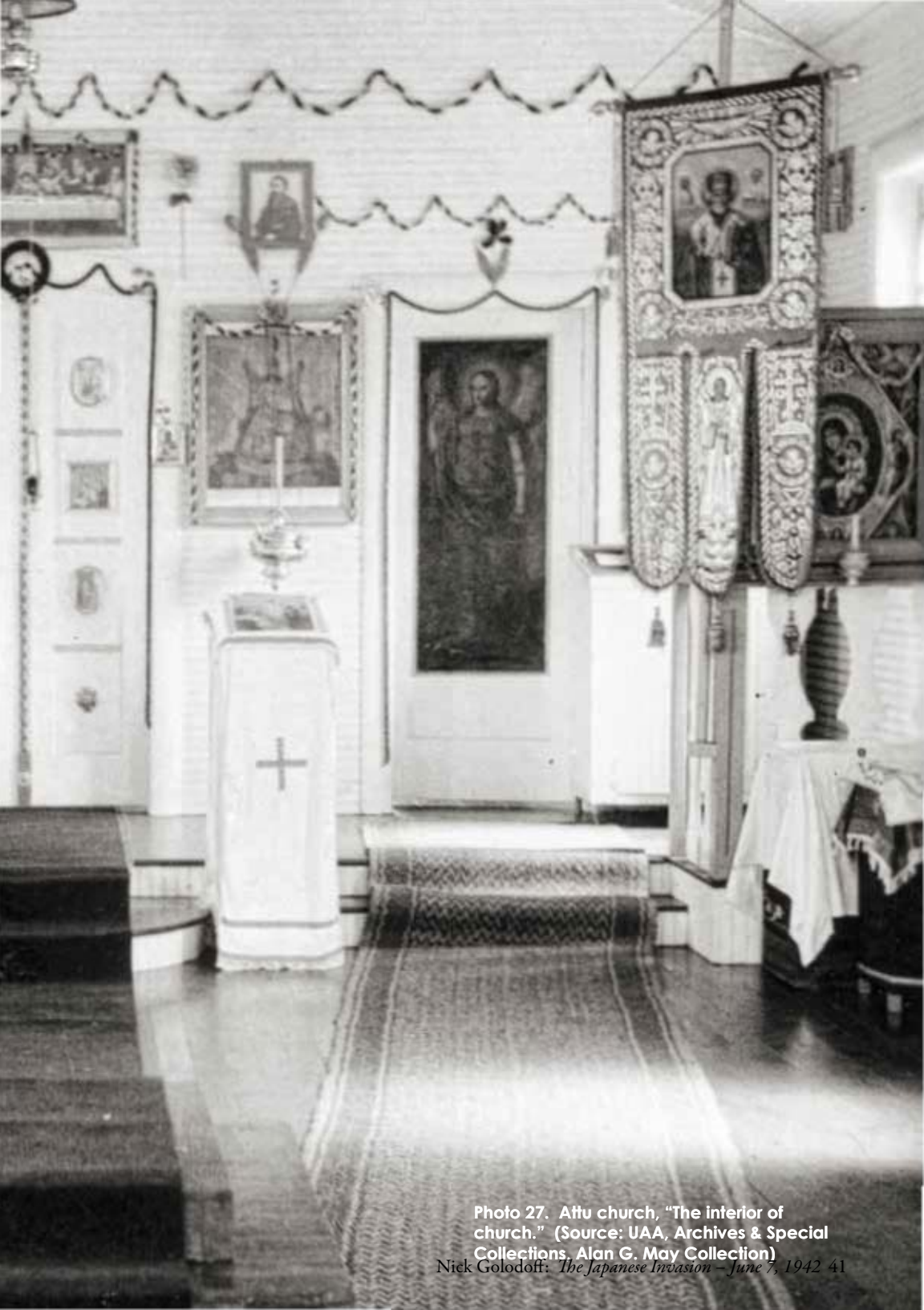
Photo 27. Attu church, "The interior of church." Niek Golodoff: The Japanese Invasion - June 7, 1942 41