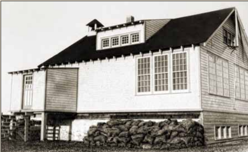
Photo 24. Attu schoolhouse.