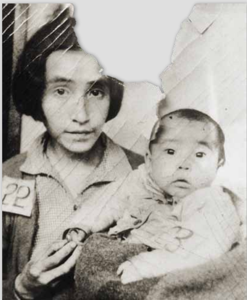
Photo 30. Mother and baby, #22 and #23.