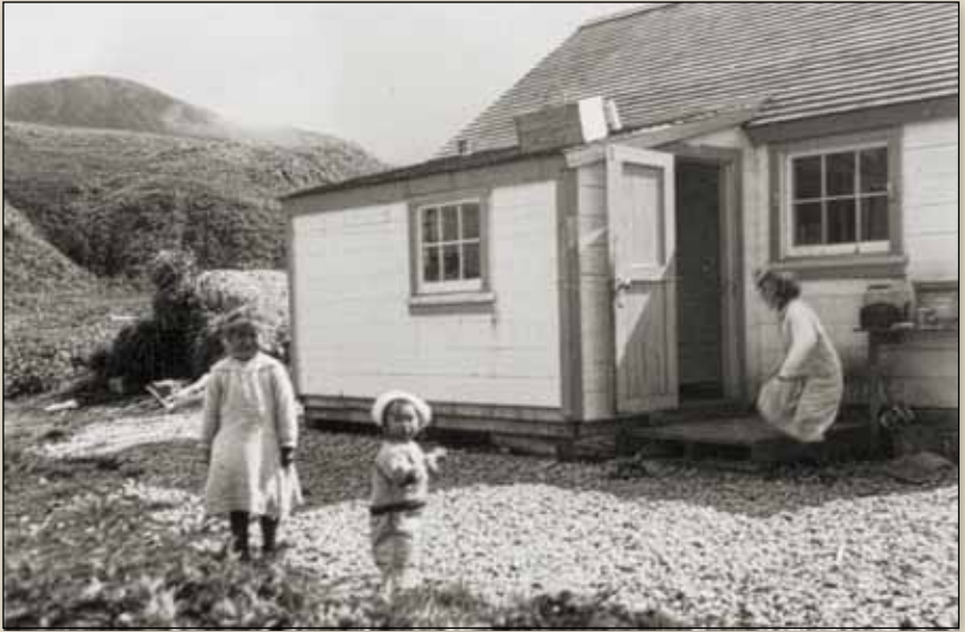
Photo 4. "Children playing outside their home."

him walk in the puddles because he was blind. I guess I was a bad boy because I used to let him walk in the puddles and he never said anything till he got to my house. Then he would tell my parents what I did. I would get kicked out of the house, but I would still do it.