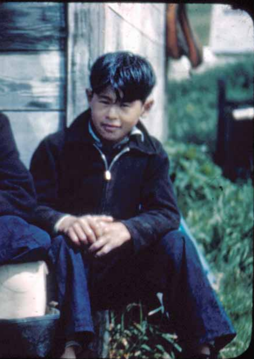
Photo 10. "Attu Natives."