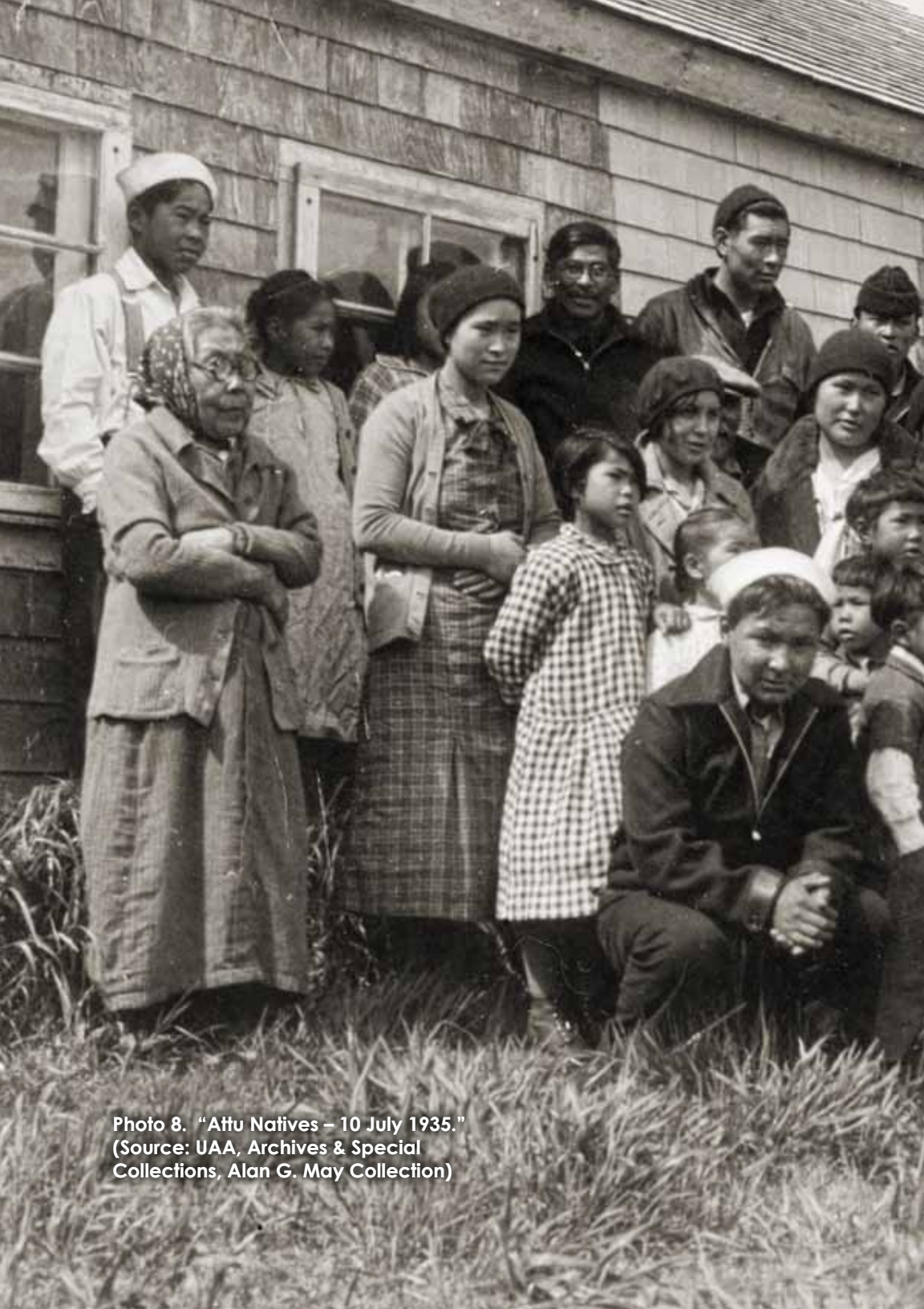
Photo 8. "Attu Natives – 10 July 1935."