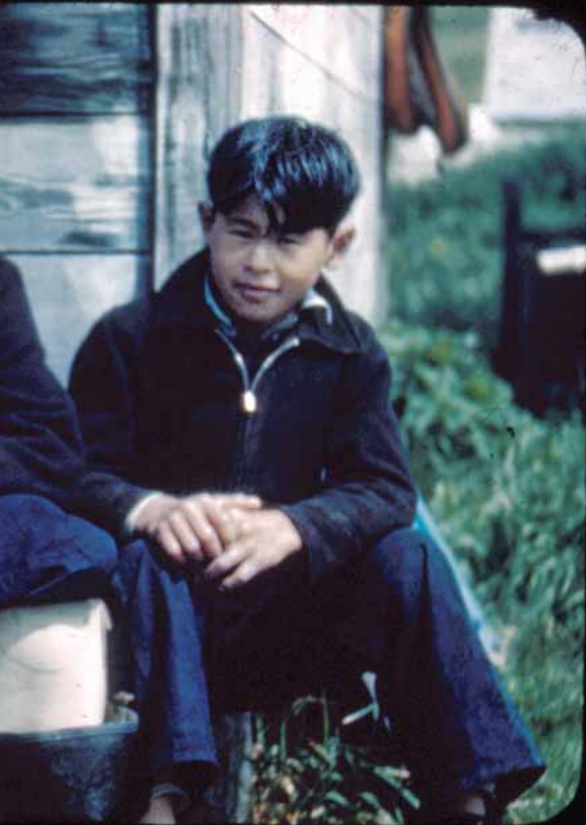
Photo 10. "Attu Natives."