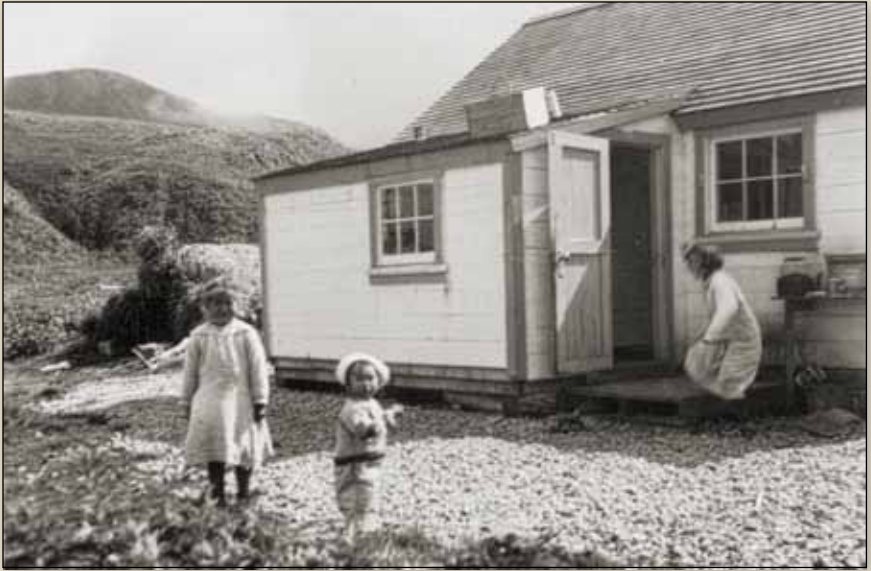
Photo 4. "Children playing outside their home."

him walk in the puddles because he was blind. I guess I was a bad boy because I used to let him walk in the puddles and he never said anything till he got to my house. Then he would tell my parents what I did. I would get kicked out of the house, but I would still do it.