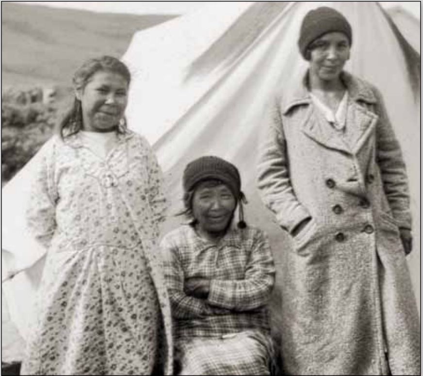
Photo 12. "The 'Rock of Ages' centre and two other natives."