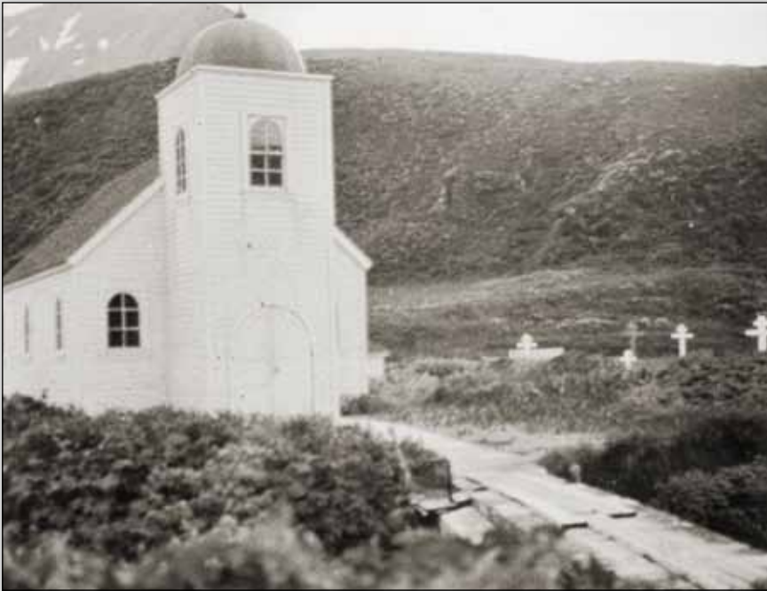
Photo 19. The new church, built in 1932. "From the church looking down the main street. View of a wooden plank pathway to the church, with orthodox crosses marking graves on the right."

May noted that when Schroeder arrived in late July 1936, all the residents were pleased to see him and he seemed like a nice man (May 1936:129).