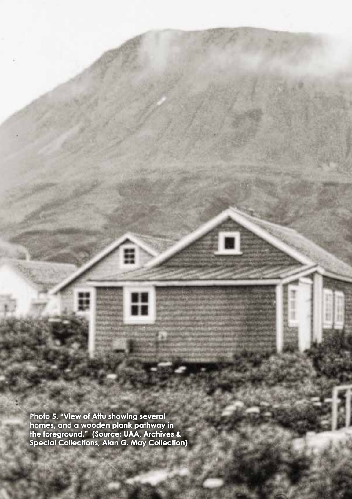
Photo 5. "View of Attu showing several homes, and a wooden plank pathway in the foreground."