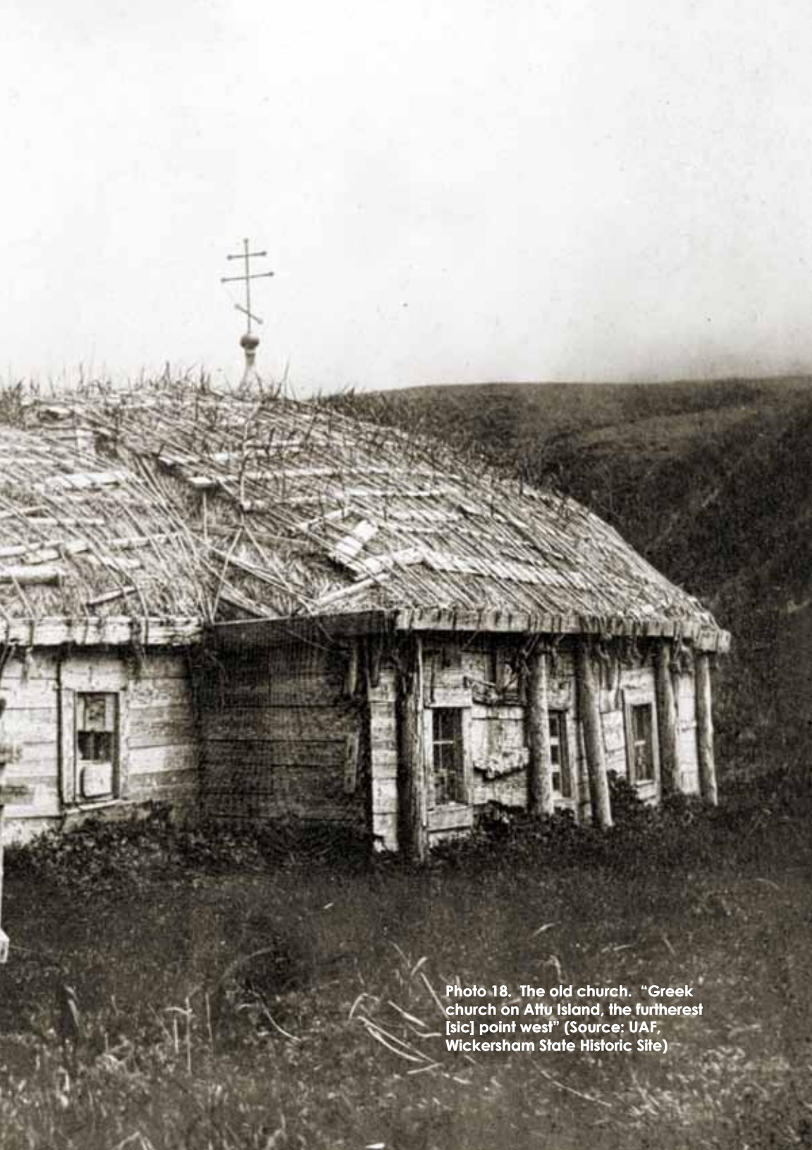
Photo 18. The old church. "Greek church on Attu Island, the furthest [sic] point west"