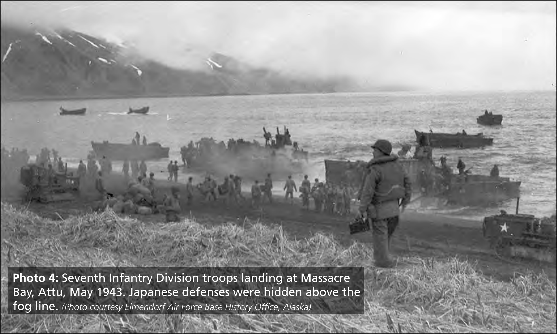
Photo 4: Seventh Infantry Division troops landing at Massacre Bay, Attu, May 1943. Japanese defenses were hidden above the fog line.