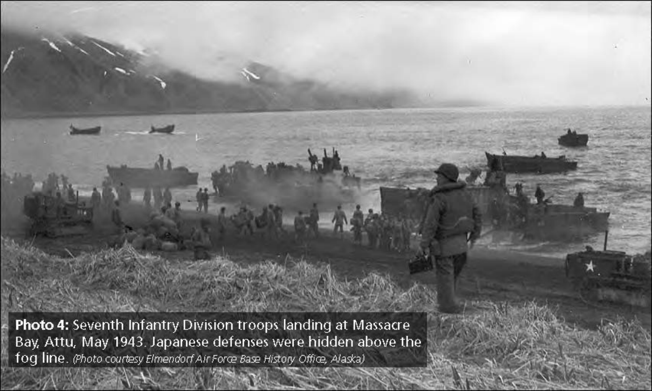
Photo 4: Seventh Infantry Division troops landing at Massacre Bay, Attu, May 1943. Japanese defenses were hidden above the fog line.