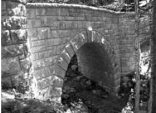
Left to right: Bicyclists near Eagle Lake, Jordan Pond Gate Lodge, horseback riders, Waterfall Bridge