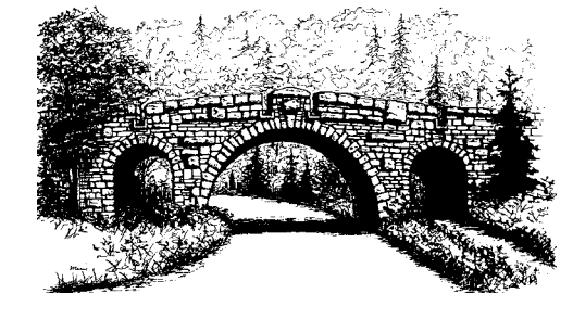
Carriage road bridges, top to bottom: Hadlock Brook Bridge, Deer Brook Bridge, Stanley Brook Bridge. Right: Little Harbor Brook Bridge

EXPERIENCE YOUR AMERICA™ The National Park Service cares for special places saved by the American people so that all may experience our heritage.