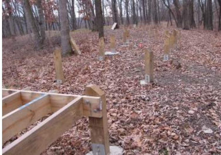
Nazekaw Terrace Boardwalk construction terminus (linear mounds visible in left background).