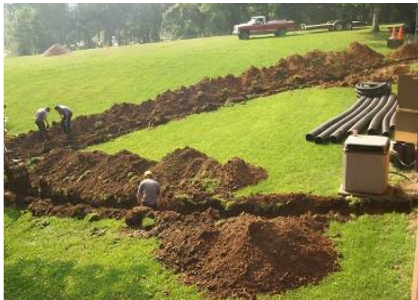
Park headquarters drainage improvements (2000) performed without completing Section 106 review. Geophysical evidence now shows many mound remnants – potentially with intact burials – in the headquarters vicinity.

The wake-up call this SMR provides should be the impetus for critical evaluation by all employees at all levels involved with the compliance review process. Traditionally viewed as an obstacle or bottleneck, Section 106 offers the opportunity (legal requirement notwithstanding) to take stock of the potential impacts of a proposed project, and to carefully consider whether or not it meets the needs of the park, the stakeholders, and the public in a manner most suited to the agency mission and principles.