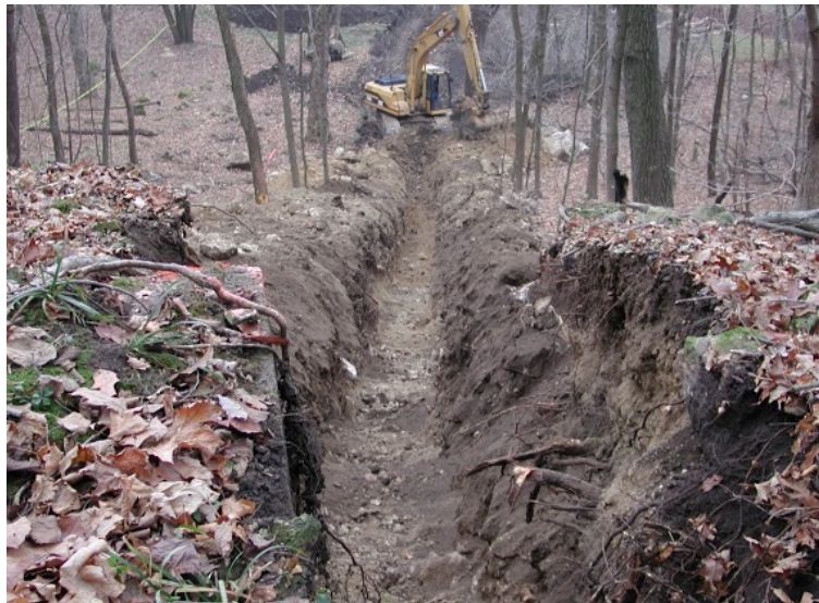
Reservoir waterline project (2005). The lower portions of this project took place on the Nazekaw Terrace, a site known to have had more than 60 burial and ceremonial mounds in the past.

The Service thus established shall promote and regulate the use of the Federal areas known as national parks, monuments, and reservations hereinafter specified by such means and measures as conform to the fundamental purpose of the said parks, monuments, and reservations, which purpose is to conserve the scenery and the natural and historic objects and the wild life therein and to provide for the enjoyment of the same in such manner and by such means as will leave them unimpaired for the enjoyment of future generations.