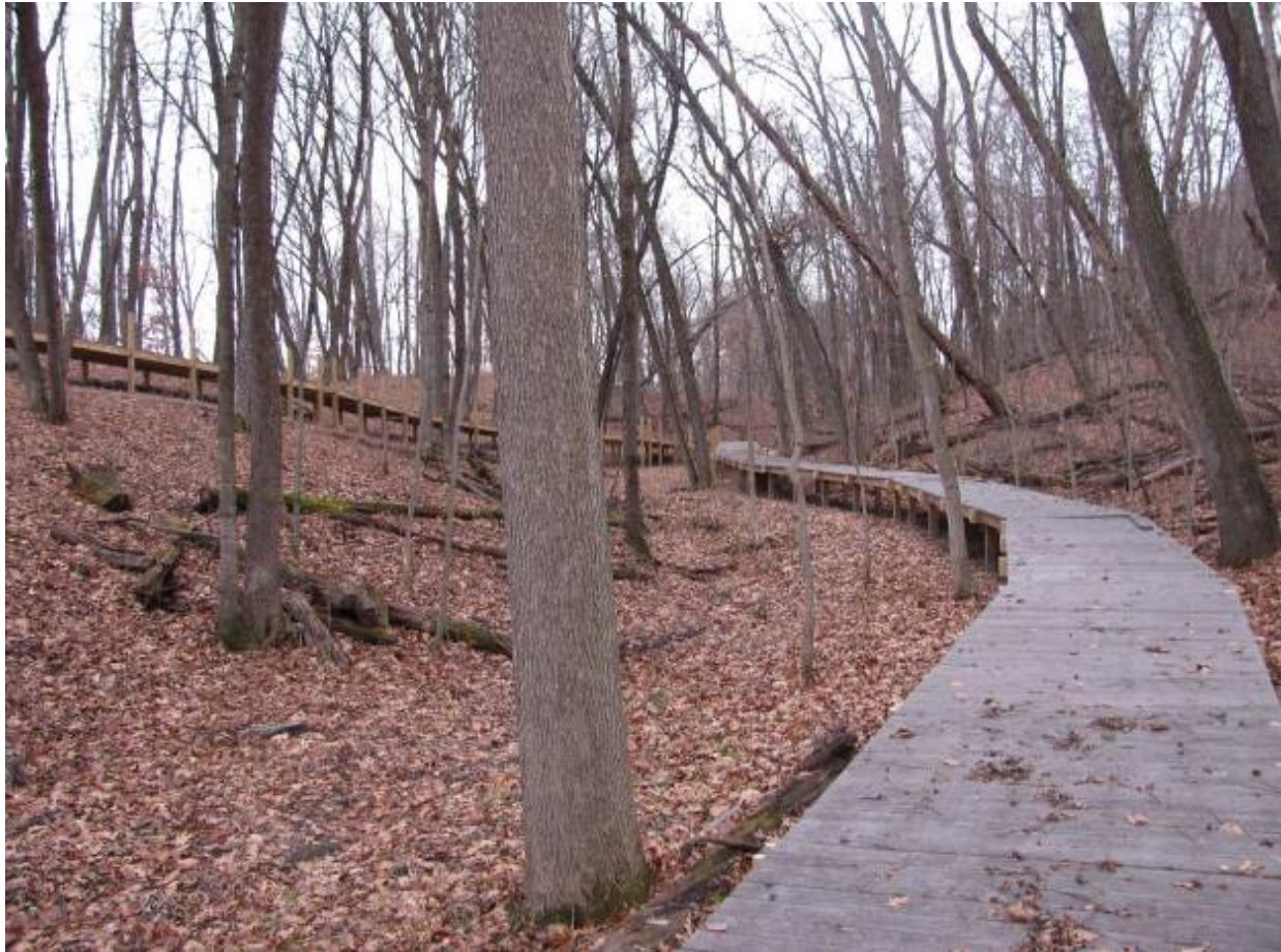
Nazekaw Terrace Boardwalk, constructed without completing SHPO or tribal consultation in 2008-09 (construction terminated by the NPS in 2009, boardwalk removed in 2010).