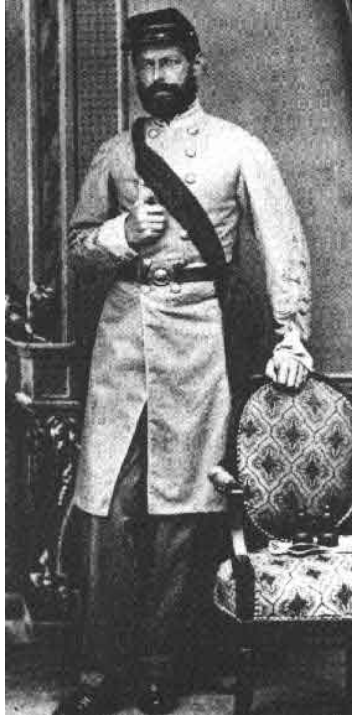
Captain Henry Wirz

A central figure in the film Andersonville is the prison superintendent, Captain Henry Wirz.