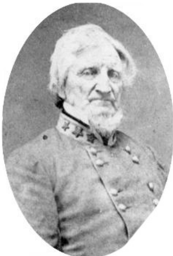
General John Winder

During the film's closing credits, the film makes the oft-repeated claim that Wirz was the only person to be prosecuted or executed after the Civil War. This claim originates with Wirz's supporters, who sought to portray him as the sole martyr and scapegoat of a vindictive and victorious army. In reality, there were nearly 1,000 military tribunals between the close of the war and early 1866, and several of these resulted in executions, Wirz being the most famous of these. More tribunals were planned, but never materialized after President Andrew Johnson ordered all military tribunals stopped in early 1866.