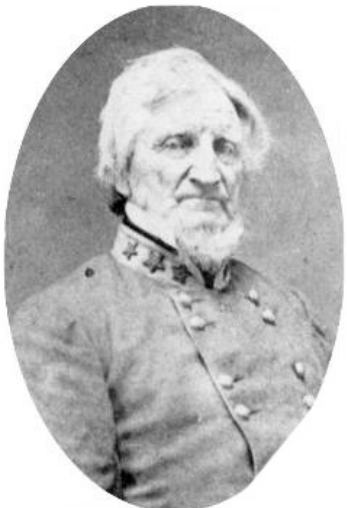
General John Winder

During the film's closing credits, the film makes the oft-repeated claim that Wirz was the only person to be prosecuted or executed after the Civil War. This claim originates with Wirz's supporters, who sought to portray him as the sole martyr and scapegoat of a vindictive and victorious army. In reality, there were nearly 1,000 military tribunals between the close of the war and early 1866, and several of these resulted in executions, Wirz being the most famous of these. More tribunals were planned, but never materialized after President Andrew Johnson ordered all military tribunals stopped in early 1866.