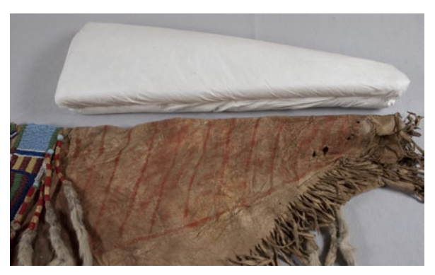
Figure 6. Tuck sheeting into slits on all three sides.