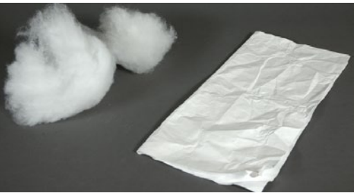
Figure 1. Assemble two support pieces of batting and sheeting.

Measure the length of one legging. Add at least 2" extra inches to your measurement at the widest end, and at least 1 inch to the narrow end. This allows enough room for folding and closure. See Figure 1 and 2. Some leggings have fringes and most have an angled high thigh area. Include these in the measurements.