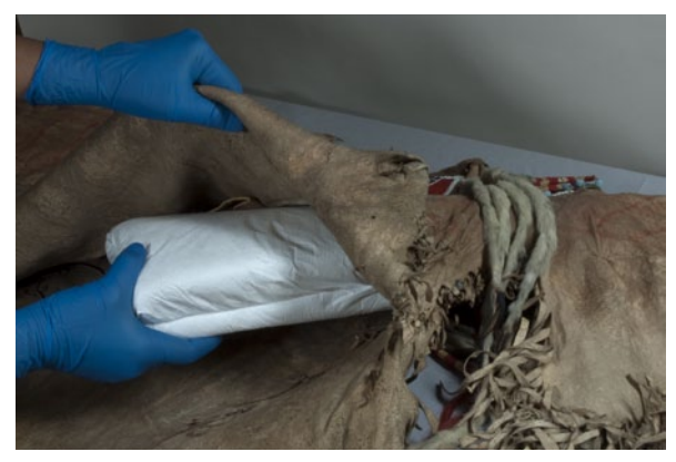
Figure 7. Insert completed support into sleeve.

These supports can be easily adapted for other types or styles of clothing. For more information on the care of textiles and/or leather and skin objects, see NPS Museum Handbook , Part I, Appendix K: Care of Textile Objects and Appendix S: Curatorial Care of Objects Made from Leather and Skin Products.