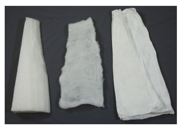
Figure 4. Measure and cut rigid foam, batting and sheeting.

8. Insert completed support piece into the sleeve, see Figure 6 and 7 and repeat for the remaining sleeve and chest pieces.