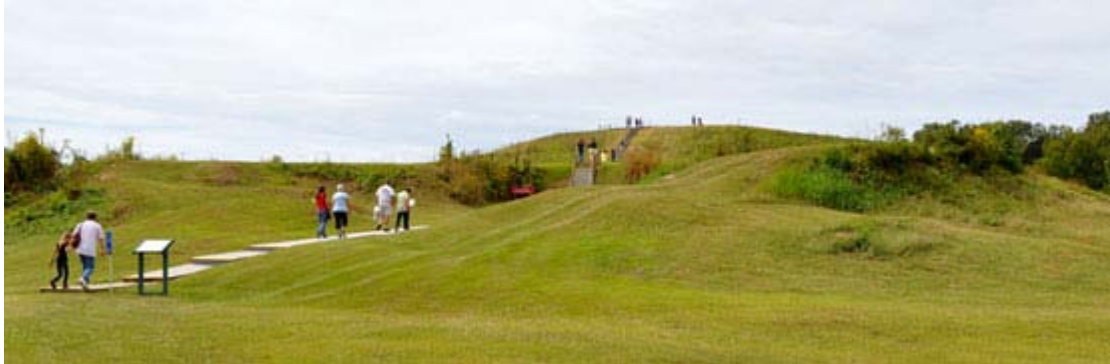
Visitors climb to the top of Mound A, the “Bird Mound” at Poverty Point World Heritage Site.