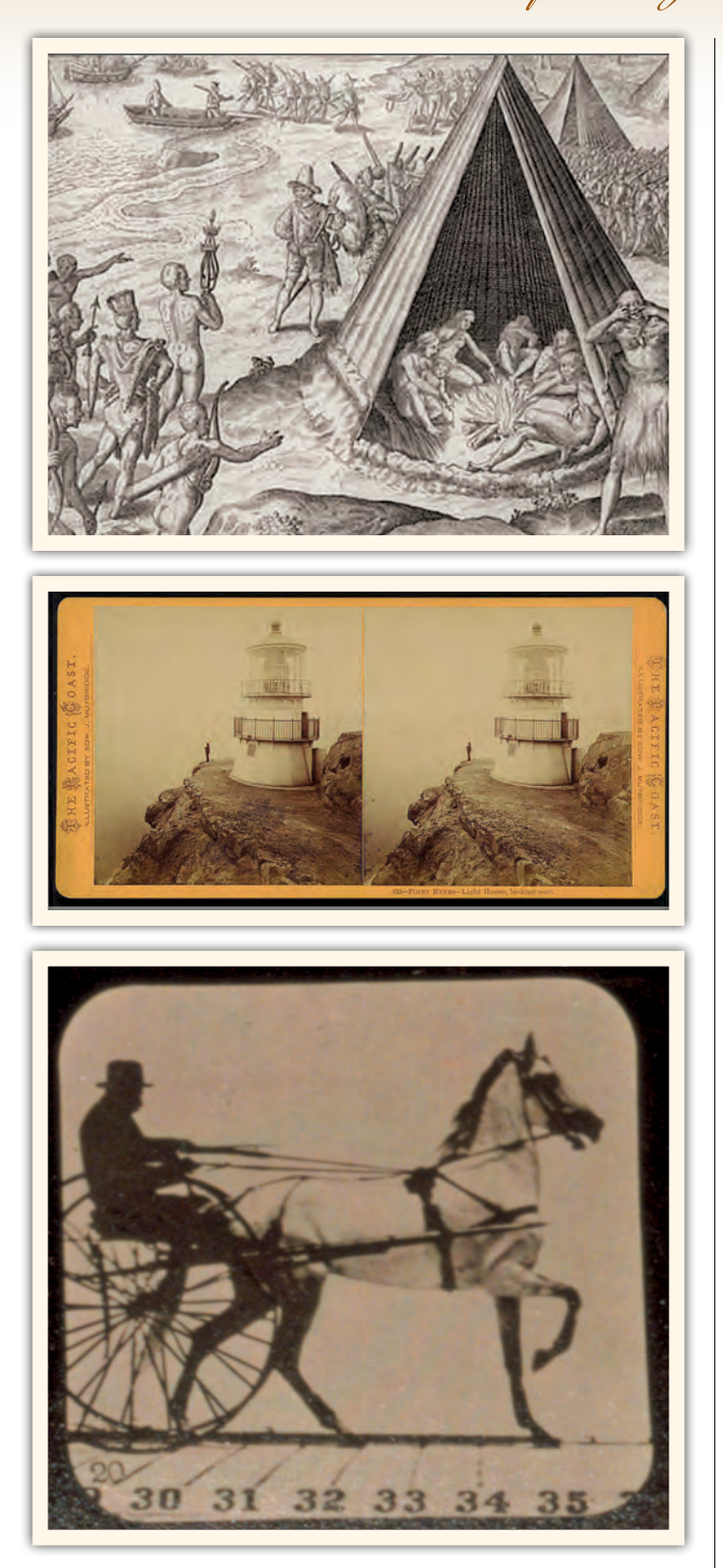
TOP TO BOTTOM: Drake landing at "New Albion" (Point Reyes, California) in 1590 by Theodor De Bry (photo U.S. Public domain); Stereophoto of Point Reyes lighthouse in 1870 by Eadweard Muybridge (courtesy of the Library of Congress); The famous trotter Oakland Maid (Speculation x Lady Vernon), four generations from Justin Morgan. Owned by Leland Stanford. Her dam, Lady Vernon (Engineer 2d by Engineer by Justin Morgan) was one of the first Morgans brought to California in 1853 (Photo by Eadweard Muybridge, courtesy of the Library of Congress).

It was believed to be the site for the original adobe rancho of Rafael Garcia, who was awarded one of the first land grants in 1836. Garcia's buildings were demolished by the earthquake of 1868, and the present W Ranch was part of the holdings of Charles Webb Howard. It was rebuilt and designed to be a showplace of the Shafter/Howard dairy empire which dominated the landscape from 1857-1939. By the turn of the century, Bear Valley Ranch included four dairy ranches, U, W, Y, and Z, covering 7,739 acres. It lies at the foot of Mount Wittenberg, edged by a mosaic of forested hills and meadows, ridges and gulches covered with brush, coastal scrub and grass, the rolling pastures which slope gently toward the Pacific, disappearing to the misty fog. The Morgan horses seem a natural part of this magical landscape that is almost a step back in time.