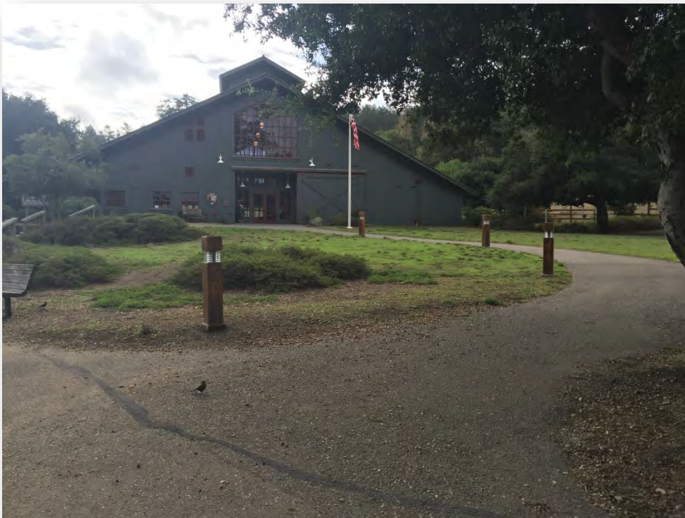
Route into the Bear Valley Visitor Center.