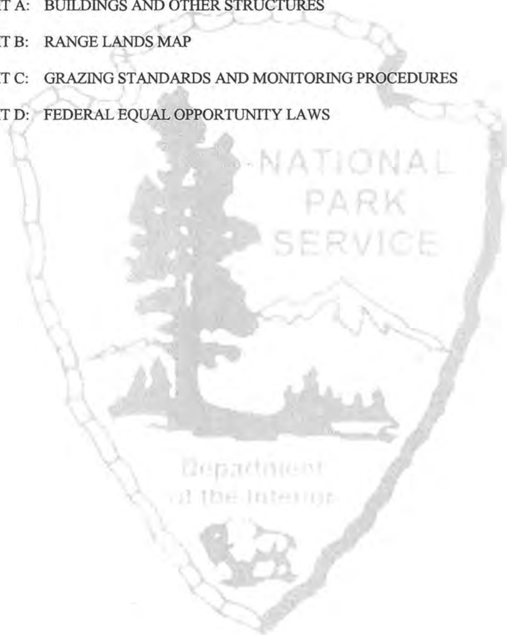
EXHIBIT D: FEDERAL EQUAL OPPORTUNITY LAWS

EXHIBIT C: GRAZING STANDARDS AND MONITORING PROCEDURES