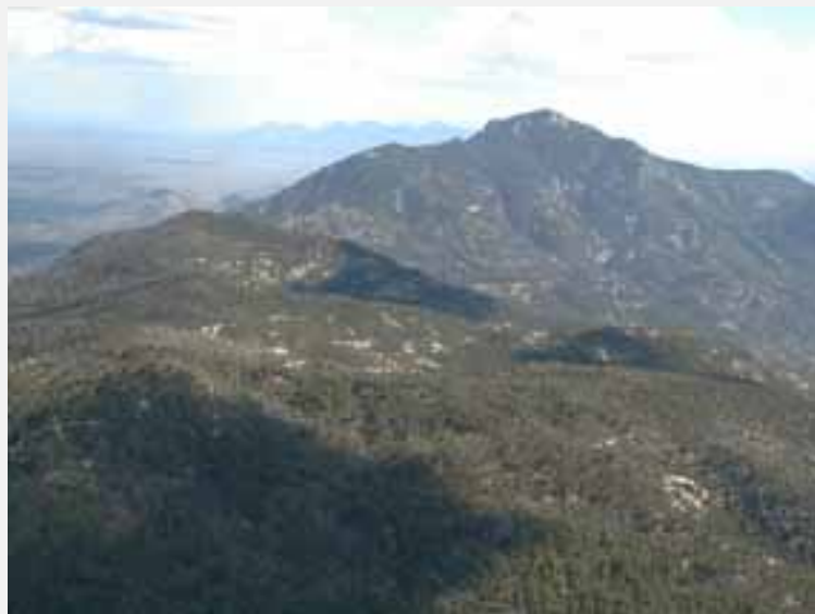
Rincon Peak www.nps.gov/sagu

By improving communication within Saguaro NP, we are developing an environment that provides guidance and clarity while instilling ownership and support in accomplishing goals and initiatives. Saguaro NP has improved communication amongst employees through all-employee meetings, leadership meetings, and park-wide training sessions. Staff and partners are encouraged to give feedback or comments, and they are invited to participate in the Green Team’s activities in any capacity they choose. Saguaro NP has increased its climate change messaging towards the public, both in-person and through the online community. Environmental education programs, interpretive events, social media posts, and the park websites teach on the complex themes of climate change and sustainability.