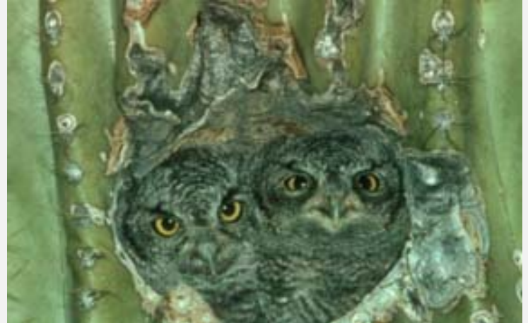
Elf Owls in a Saguaro Cavity www.nps.gov/sagu

As a participant in the National Park Service's (NPS) Climate Friendly Parks (CFP) program, Saguaro National Park (NP) belongs to a network of parks nationwide that are putting climate friendly behavior at the forefront of park operations and resource management. As part of this program, Saguaro NP has conducted a greenhouse gas (GHG) emission inventory, participated in a climate change and sustainability educational workshop, set climate change mitigation and GHG emission reduction goals, and integrated these actions into a park-wide Environmental Management System (EMS).