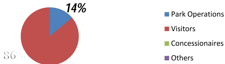
Haleakalā National Park 2008 Total Emissions by Park Unit