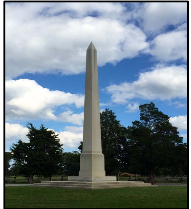
Monument to George Washington at GEWA

The EMS takes a systematic approach to identifying and addressing environmental impacts at the park. The EMS provides a framework for tracking environmental protection and sustainability priorities and details the implementation of these actions. By integrating CFP-related actions into the parks' EMS, GEWA and THST are taking an integrated approach to climate change response and sustainable management of park resources.