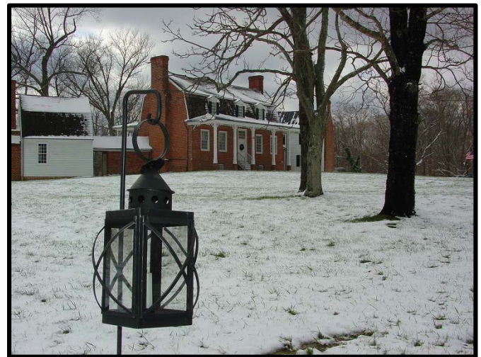
Thomas Stone House

The elements of our EMS form the foundation of the environmental protection, climate change response, and sustainability work we will accomplish at GEWA and THST.