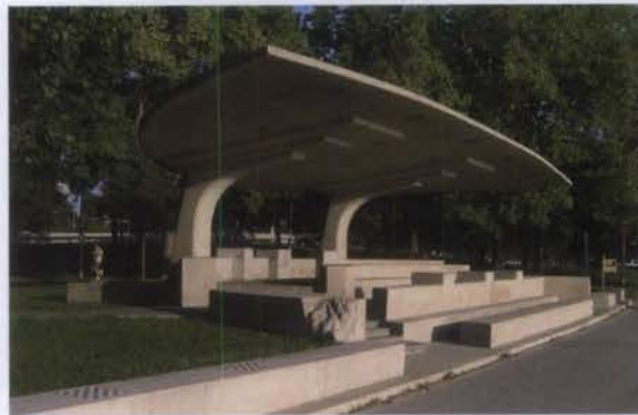
Figure 8. The Chess Pavilion in Chicago's Lincoln Park was designed by architect Morris Webster and constructed in 1956. The pavilion is a distinctive landscape feature, with its reinforced concrete cantilevered slab that provides cover for chess players.

Materials and workmanship used in the construction of historic concrete structures, particularly those built before the First World War, sometimes present potential sources of problems. For example, where the aggregate consisted of cinder from burned coal or crushed brick,