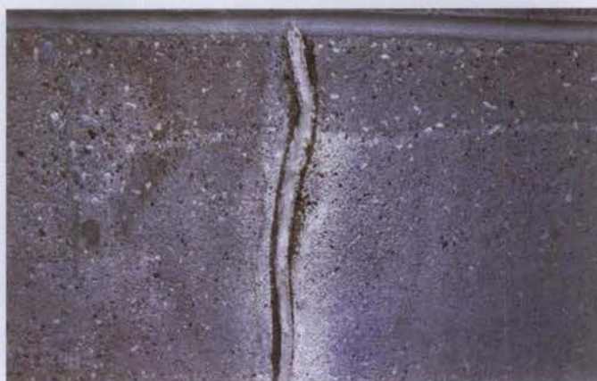
Figure 19. A high-speed grinder is used to widen a crack in preparation for installation of a sealant. This process is called "routing." After the crack is prepared, the sealant is installed to prevent moisture infiltration through the crack. Although sealant repairs can provide a durable, watertight repair for moving cracks, they tend to be very visible.

due to original construction techniques, architectural design, or differential exposure to weather. Trial repairs and mock-ups are used to evaluate the proposed replacement concrete work and to refine construction techniques (Fig 20).