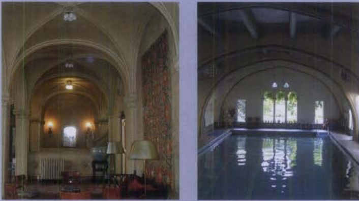
Figure 10. The Berkeley City Club has significant interior spaces and features of concrete construction, including the lobby and pool.

The expanded use of concrete provided new opportunities to create dramatic spaces and ornate architectural detail on the interiors of buildings, at a significant cost savings over traditional construction practices. The architectural design of the Berkeley City Club in Berkeley, California, expressed Moorish and Gothic elements in concrete on the interior of the building (Fig. 10). Used as a woman's social club, the building was designed by noted California architect Julia Morgan and constructed in 1929. The vaulted ceilings, columns, and ornamental capitals of the lobby and the ornamental arches and beamed ceiling of the "plunge" are all constructed of concrete.