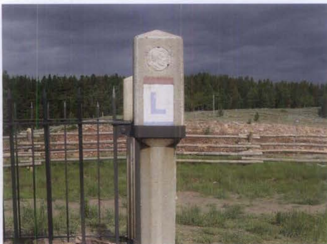
Figure 3. The Lincoln Highway Association promoted construction of a high quality continuous hard surface roadway across the country. The Boys Scouts of America installed concrete road markers along the Lincoln Highway in 1928.

Impressed by the economic advantages of poured gravel wall or "lime-grout" construction, the Quartermaster General's Office of the War Department embarked on a campaign to improve the quality of building for frontier military posts. As a result, lime-grout structures were constructed at several western posts soon after the Civil War, including Fort Fred Steele and Fort Laramie, both in Wyoming (Fig. 2). By the 1880s, sufficient experience had been gained with unreinforced concrete to permit construction of much larger buildings. A notable example from this period is the Ponce de Leon Hotel in St. Augustine, Florida.