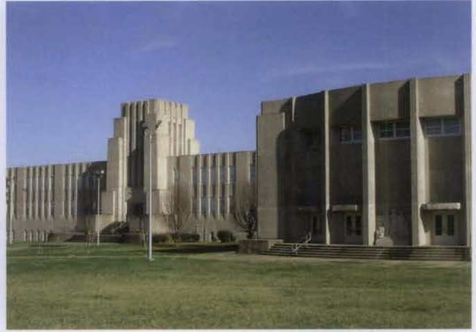
Figure 6. The Bailey Magnet School in Jackson, Mississippi, was designed as the Jackson Junior High School by the firm of N.W. Overstreet & Town in 1936. The streamlined building exemplifies the applicability of concrete to creating a modern architectural aesthetic.