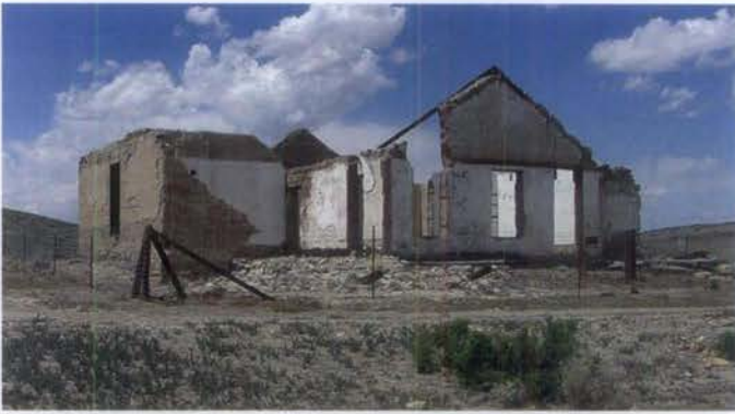
Figure 2. Chatterton House was the home of the post trader at Fort Fred Steel in Wyoming, one of several forts established in the 1860s to protect the Union Pacific Railroad. The walls of the post trader's house were built using stone aggregate and lime, without cement. The use of this material presents special preservation challenges.

publicized in the second edition of Orson S. Fowler's A Home for All (1853) which described the advantages of "gravel wall" construction to a wide audience. The town of Seguin, Texas, thirty-five miles east of San Antonio, already had a number of concrete buildings by the 1850s and came to be called "The Mother of Concrete Cities," with approximately ninety concrete buildings made from local "lime water" and gravel (Fig. 1).