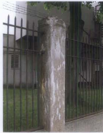
Figure 15. Evidence of moisture movement through concrete is apparent in the form of mineral deposits on the concrete surface. Cyclic freezing and thawing of entrapped moisture, and corrosion of embedded reinforcement, have also contributed to deterioration of the concrete column on this fence at Crocker Field in Fitchburg, Massachusetts, designed by the Olmsted Brothers.

A condition assessment of a concrete building or structure should begin with a review of all available documents related to original construction and prior repairs. While plans and specifications for older concrete buildings are not always available, they can be an invaluable resource and every attempt should be made to find them. They may provide information on the composition of the concrete mix or on the type and location of reinforcing bars. If available, documents related to past repairs should also be reviewed to