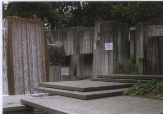
Figure 9. The Ira C. Keller Fountain in Portland, Oregon, was designed by Lawrence Halprin and constructed in 1969. The fountain is constructed primarily of concrete pillars with formboard textures and surrounding elements, patterned with geometric lines, which facilitate the path of water.