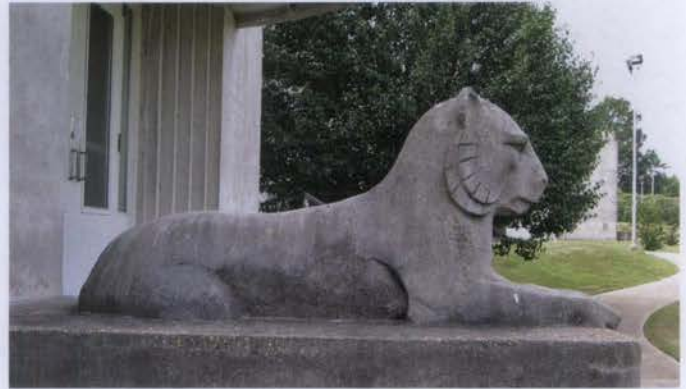
Figure 7. Detailed bas reliefs as well as sculptures, such as this lion at the Bailey Magnet School, could be used as ornamentation on concrete buildings. Sculptural concrete elements were typically cast in molds.

Throughout the twentieth century, a wide range of architectural and engineering structures were built using concrete as a practical and cost-effective choice—and concrete also became valued for its aesthetic qualities. Cast in place and precast concrete were readily adapted to the Streamlined Moderne style, as exemplified by the Bailey Magnet School in Jackson, Mississippi, designed as the Jackson Junior High School by N.W. Overstreet & Town in 1936 (Figs. 6 and 7). The school is one of many concrete buildings designed and constructed under the auspices of the Public Works Administration. Recreational structures and landscape features also utilized the structural range and unique character of exposed concrete to advantage, as seen in Chicago’s Lincoln Park Chess Pavilion, designed by Morris Webster in 1956 (Fig. 8), and the Ira C. Keller Fountain in Portland Oregon, designed by Lawrence Halprin in 1969 (Fig. 9). Concrete was also popular for building interiors, with ornamental features and exposed structural elements recognized as part of the design aesthetic (See Figs. 10 and 11 in sidebar).