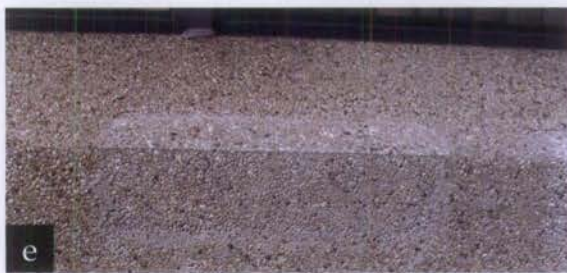
Figure 18. (a) Exposed aggregate precast concrete is sounded with a hammer to detect areas of deterioration. Corrosion of the exposed reinforcing steel bar has led to spalling of the adjacent concrete. (b) Samples of aggregate considered for use in repair concrete are compared to the original concrete materials in terms of size, color, texture, and reflectance. (c) Various sample panels are made using the selected concrete repair mix design for comparison to the original concrete on the building, and the mix design is adjusted based on review of the samples. (d) After removal of the spall, the concrete surface is prepared for installation of a formed patch. (e) Prior to placement of the concrete, a retarding agent is brush-applied to the inside face of the formwork to slow curing at the surface. After the concrete is partially cured, the forms are removed and the surface of the concrete is rubbed to remove some of the paste and expose the aggregate to match the original concrete.

to cement ratio. Some admixtures, including polymer modifiers, may change the appearance of the concrete mix. Design of the concrete patching material should address characteristics required for durability, workability, strength gain, compressive strength, and other performance attributes. During installation of the repair, skilled workmanship is required to ensure proper mixing procedures, placement, consolidation, and curing.