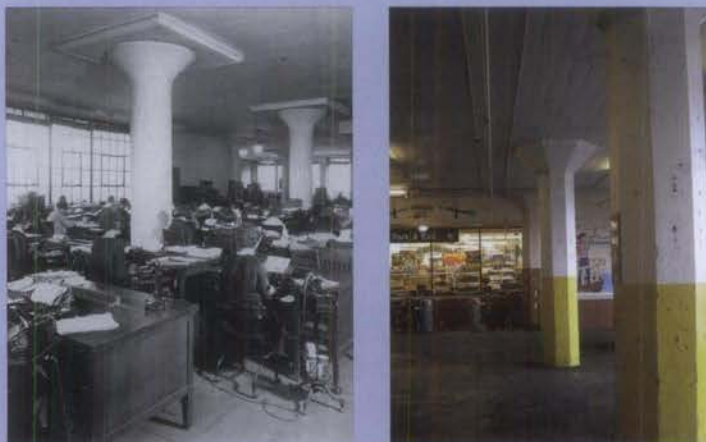
Figure 11. Whether in a circa 1925 office (left) or in a parking garage and retail facility (right), exposed concrete structures help characterize these building interiors.

The historic character of a building's interior can also be conveyed in a more utilitarian manner in terms of concrete features and finishes (Fig. 11). The exposed concrete structure—columns, capitals, and drop panels—is an integral part of the character of this old commercial building in Minneapolis. In concrete warehouse and factory buildings of the early twentieth century, exposed concrete columns and formboard finish concrete slab ceilings are common features as seen in this warehouse, now converted for use as a parking garage and shops.