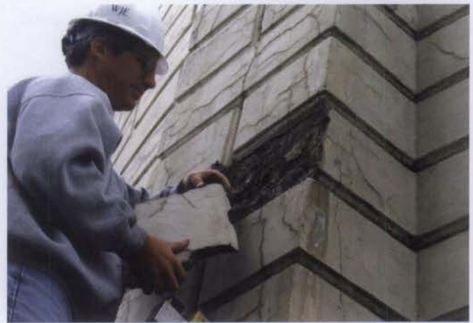
Figures 14. Layers of architectural concrete that have debonded (spalled) from the surface were removed from a historic water tank during the investigation performed to assess existing conditions.

phenomena when water-rich cement paste (laitance) rises to the surface. The resulting weak material is vulnerable to spalling of thin layers, or scaling. In some cases, spalling of the concrete can diminish the load-carrying capacity of the structure.