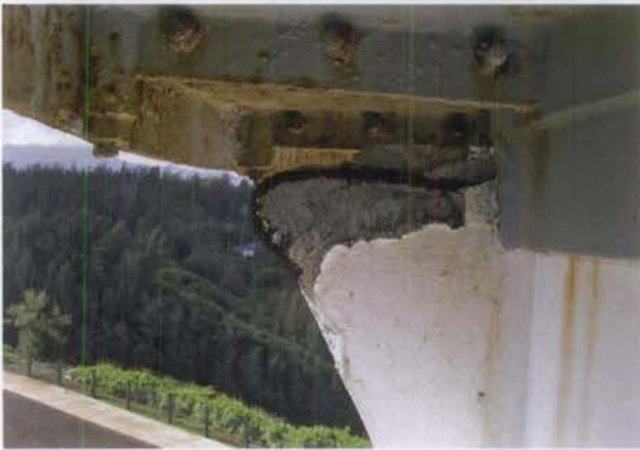
Figure 12. The concrete lighthouse at the Kilauea Point Light Station, Kilauea, Kauai, Hawaii, was constructed circa 1913. The concrete, which was a good quality, high strength mix for its day, is in good condition after almost one hundred years in service. Deterioration in the form of spalling related to corrosion of embedded reinforcing steel has occurred primarily in areas of higher ornamentation such as projecting bands and brackets (see close-up photo).

the concrete tends to be weak and porous because these aggregates absorb water. Some of these aggregates can be extremely susceptible to deterioration when exposed to moisture and cyclic freezing and thawing. Concrete was sometimes compromised by inclusion of seawater or beach sand that was not thoroughly washed with fresh water, a condition more common with coastal fortifications built prior to 1900. The sodium chloride present in seawater and beach sand accelerates the rate of corrosion of the reinforced concrete.