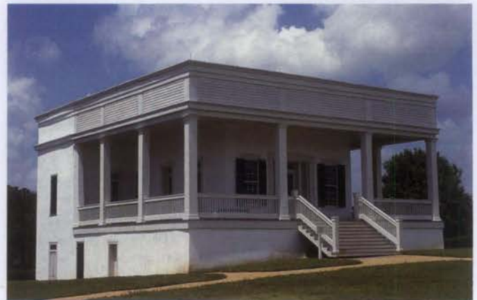
Figure 1. The Sebastopol House in Seguin, Texas, is an 1856 Greek Revival-style house constructed of lime concrete. Lime concrete or “limecrete” was a popular construction material, as it could be made inexpensively from local materials. By 1900, the town had approximately ninety limecrete structures, twenty of which remain.

The Erie Canal in New York is an example of the early use of concrete in transportation in the United States. The natural hydraulic cement used in the canal construction was processed from a deposit of limestone found in 1818 near Chittenango, southeast of Syracuse. The use of concrete in residential construction was