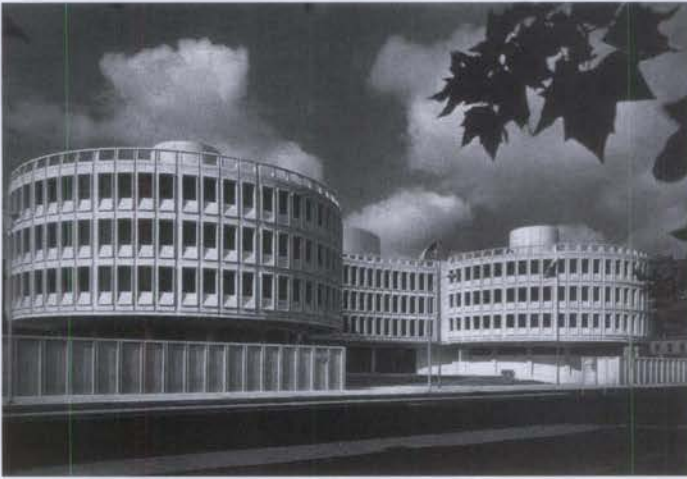
Figure 5. Following World War II, architects and engineers took advantage of improvements in concrete production, quality control, and advances in precast concrete to design structures such as the Police Headquarters building in Philadelphia, Pennsylvania, constructed in 1961.

Highway as an example. Concrete “seedling miles” were constructed in remote areas to emphasize the superiority of concrete over unimproved dirt. The Association believed that as people learned about concrete, they would press the government to construct good roads throughout their states. Americans’ enthusiasm for good roads led to the involvement of the federal government in road-building and the creation of numbered U.S. routes in the 1920s (Fig. 3).