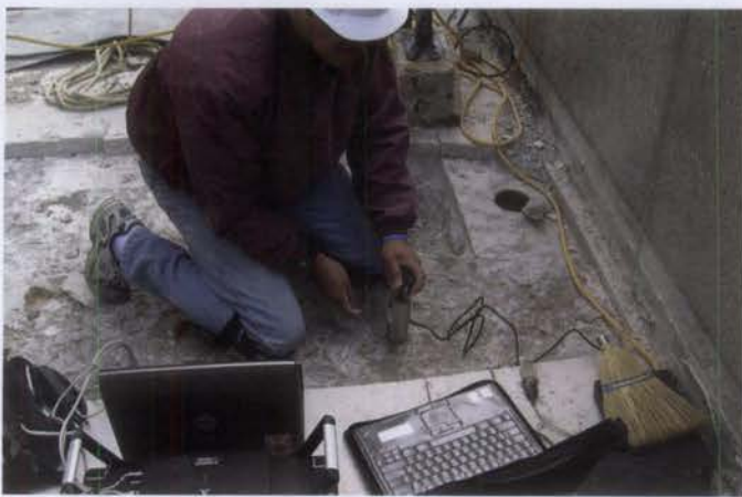
Figure 16. Impact echo testing is performed on a concrete structural slab to help determine depth of deterioration. In this method, a short pulse of energy is introduced into the structure and a transducer mounted on the impacted surface of the structure receives the reflected input waves or echoes. These waves are analyzed to help identify flaws and deterioration within the concrete.

When used with proper controls and at very low pressures (typically 35 to 75 psi), microabrasive