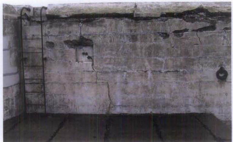
Figure 13. Fort Casey on Admiralty Head, Fort Casey, Washington, was constructed in 1898. The lift lines from placement of concrete are clearly visible on the exterior walls and characterize the finished appearance.

In the early twentieth century, concrete was sometimes placed in several layers parallel to the exterior surface. A base concrete was first created with formwork and then a more cement rich mortar layer was applied to the exposed vertical face of the