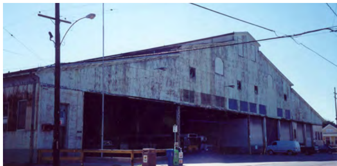
Above: The historic bus barn before rehabilitation.

Application 1 ( Compatible treatment ): This historic car barn was built c. 1893, originally to house streetcars and remained in use until it was closed in the 1990s when a new facility was constructed. After years of disuse, it was proposed to be converted into a grocery store. The sheer size and volume of the interior proved to be a good match for the new use. The car barn was large enough that the grocery store itself could fit into the front half of the building, leaving the rear portion available for parking. The openness and immense height of the interior with its exposed metal structural system contributes to the market's appeal and is also ideal for the parking area which, after all, was the building's original use. New corrugated metal replaced the rusted historic metal sheathing on the exterior. The large historic vehicular openings on the back allow access to the parking and also provide ventilation. The vehicular doors on the front were infilled with a butt glass storefront system to retain the open appearance the building had historically. This project meets the Standards.