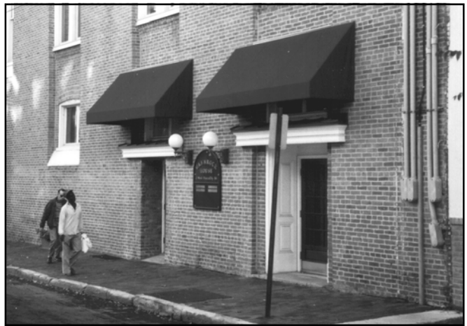
Revised treatment with a shed awning over each entrance.

Chad Randl, Technical Preservation Services, National Park Service