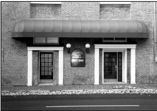
Side entrances with single continuous awning.

In order to meet the Secretary's Standards , the surrounds were removed and the long dome awning was replaced by two individual awnings. The revised treatment was more in keeping with traditional awning arrangement, shape and material. This approach identified the entrances but did not group them into a single arrangement that was contrary to the building's historic design and appearance.