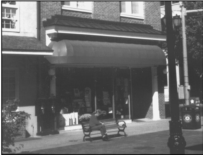
Original "long-dome" treatment for replacement awning.

To conform with the Secretary of the Interior's Standards for Rehabilitation , the inappropriate awning was replaced with a type that more accurately resembled the shape and material shown in the historic documentation and known to be common among turn-of-the-century storefronts. The replacement awning is a standard, shed shape that is sold by many companies as a stock product. Although a functioning, retractable awning would have been the most appropriate solution, the fixed, shed awning was an acceptable compromise.