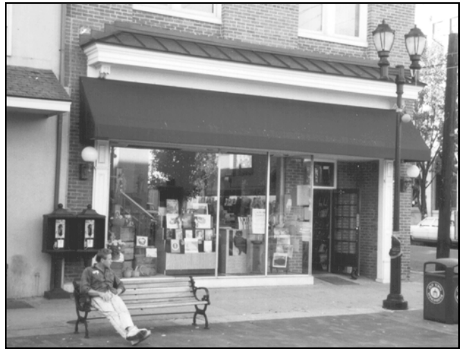
Revised solution matches historic awning shape and material.

Application 2 ( Incompatible treatment corrected to meet the Standards ): The same rehabilitation project converted two doors on the side of the building to main entrances for upper floor tenant space. A long dome awning, like that used on the front of the building, was installed over the two doors and decorative wood surrounds were applied on the sides of both entrances. The awning was not a traditional style that would have been used historically, nor would a single awning have been placed over two separate entrances. The new surrounds were also not based upon historic documentation. These two treatments were incompatible with the historic character of the building. Together they gave this secondary facade a prominence it never had.