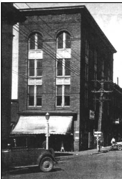
Historic photo showing retractable canvas awning.

Repair and reinstallation of awnings can be an important component of a building's rehabilitation. But an inappropriate awning treatment can diminish the building's character, or create an entirely new appearance that has no historic basis. Unless documentation exists, awnings generally should not be installed on building types that did not customarily have awnings, for example, utilitarian structures like warehouses and mills. The same goes for secondary doors and entrances that would not have historically been emphasized with an awning. New replacement awnings should be compatible with historic examples. So called "long dome" or convex awnings are usually not appropriate either in shape or, if they are vinyl, in material and appearance. Advertisements and store names should be muted rather than the central focus of the awning. If an awning treatment adversely affects the historic character of a building, the project will not meet the Secretary of the Interior's Standards, despite the fact that it may be less permanent, and more reversible, than some other rehabilitation treatments.