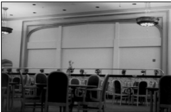
Former auditorium before rehabilitation as the dining room.

The rectangular auditorium featured tall, tripartite windows, glazed brick wainscoting, and intact proscenium arch, brass light fixtures, and a sloping floor. All these features were retained when the space was converted into a dining room, with a new level floor. A new partition was added immediately behind the proscenium for a new kitchen. The gymnasium, unlike the auditorium, was utilitarian in appearance and function, without distinguishing features or finishes. For this reason, in addition to the fact that the auditorium space was being preserved, the gymnasium was determined to be expendable, and the space divided into two-level apartments. Other interior features such as built-in wood benches, built-in cabinets and the kindergarten fireplace, were also preserved. In addition, features associated with the school's site were preserved in the rehabilitation project, providing residents with such amenities as an outdoor picnic area, benches, and courtyards. The adaptive use project successfully preserved the school's distinctive spaces, features, finishes, and site, while less distinctive elements were modified or removed.