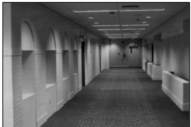
Left: Corridor after rehabilitation. Right: Corridor width and length, as well as features such as the brick wainscoting, were retained.