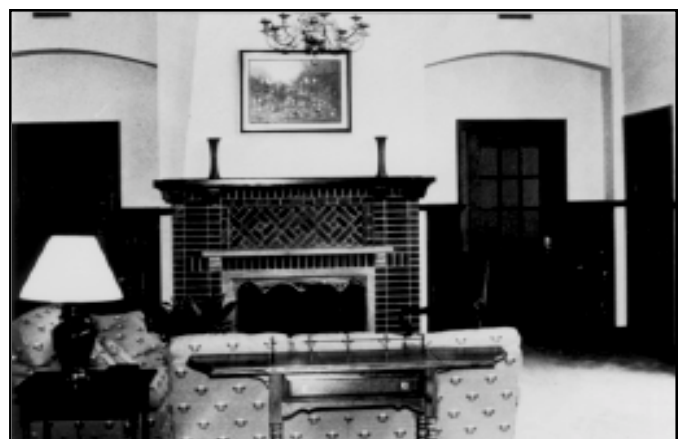
The new library (formerly a kindergarten) retains the fireplace after rehabilitation.