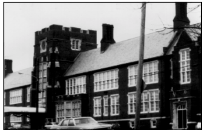
School after rehabilitation.

Issue: The rehabilitation of a historic school requires the introduction of a new, compatible use within the framework of an existing building. When rehabilitating an older school, the Secretary of the Interior's Standards for Rehabilitation call for the retention and preservation not only of the exterior features but of those distinctive interior spaces, features, and finishes that characterize the building as an educational institution.