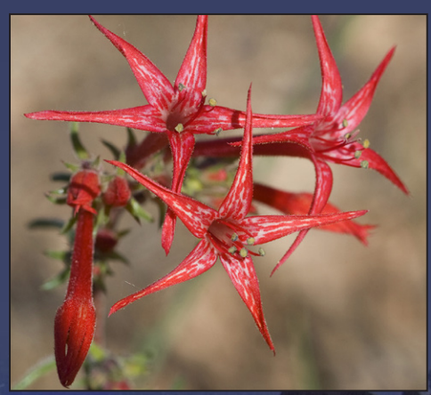
Scarlet gilia

FOR YOUR SAFETY Steep drop-offs abound here; watch children closely and stay back from cliff edges. • High elevations can be dangerous if you have heart or respiratory ailments. Know your limits—don't overexert! • Wear hiking boots and watch your footing. • Trails may be closed intermittently due to extreme weather or other hazardous conditions. • During thunderstorms stay in your vehicle; avoid trees and open areas. • Obey posted speed limits. Drivers: Watch for animals, especially after dark.