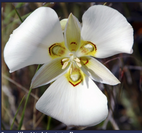
Sego lily, Utah's state flower