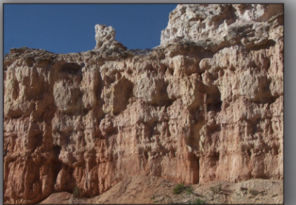
HOODOO FORMATION Hoodoos don't grow like trees but are eroded out of the cliffs where rows of narrow walls form. These thin walls of rock are called fins. Frost-wedging enlarges