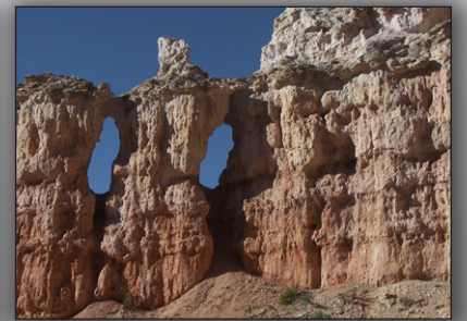
cracks in the fins, creating holes or windows. As windows grow, their tops eventually collapse, leaving a column. Rain further dissolves and sculpts these limestone pillars into