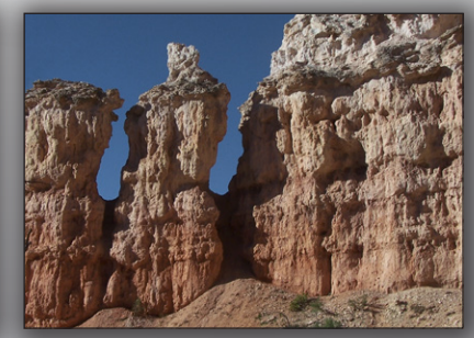
oulbous spires called hoodoos. The delicate climatic balance between snow and rain ensures that new oodoos will emerge while others become reduced to lumps of clay.

STEPS THROUGH TIME Layers in rock are like the chapters in a huge history book that describe how Earth developed. Where can you read the only unabridged edition of the planet's history? Right here.