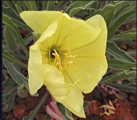
Bronze evening primrose