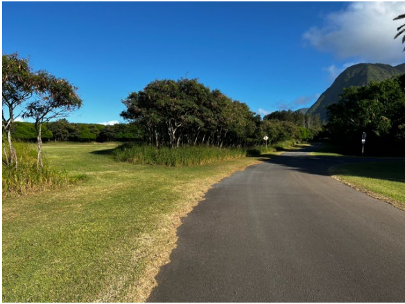
Entrance off Damien Road