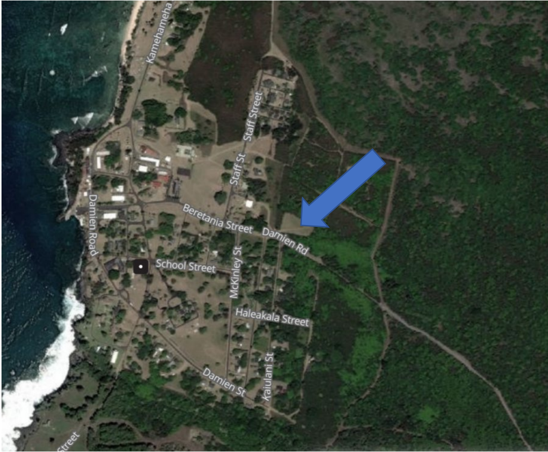
Proposed Site Location