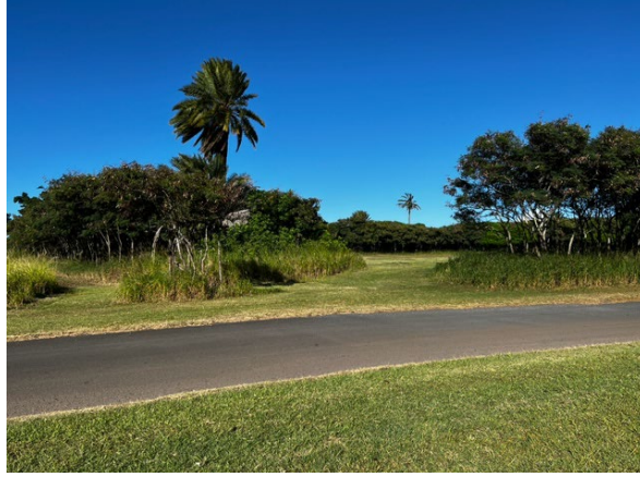
Looking at the Site from Across Damien Road