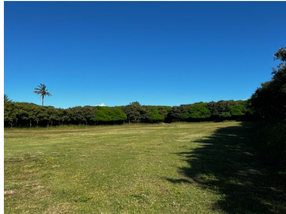
The Proposed Site