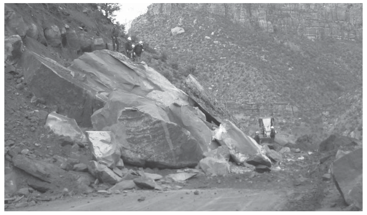
Geology is not something that "happened" in the past. It is a constant force that continues to change the landscape. Earthquakes, flash floods, and rockfalls are sudden reminders that the earth is dynamic. Rock falls are common in Zion. This 700-ton rock blocked the Zion-Mt Carmel Highway on the switchbacks for two days in February, 2005.

Flash floods occur when sudden thunderstorms dump water on exposed rock. With little soil to absorb the rain, runoff occurs quickly. These floods often occur without warning and can increase water flow by over 100 times. In 1998, a flash flood increased the volume of the Virgin River from 200 cubic feet per second to 4,500 cubic feet per second, again damaging the scenic drive at the Sentinel Slide.