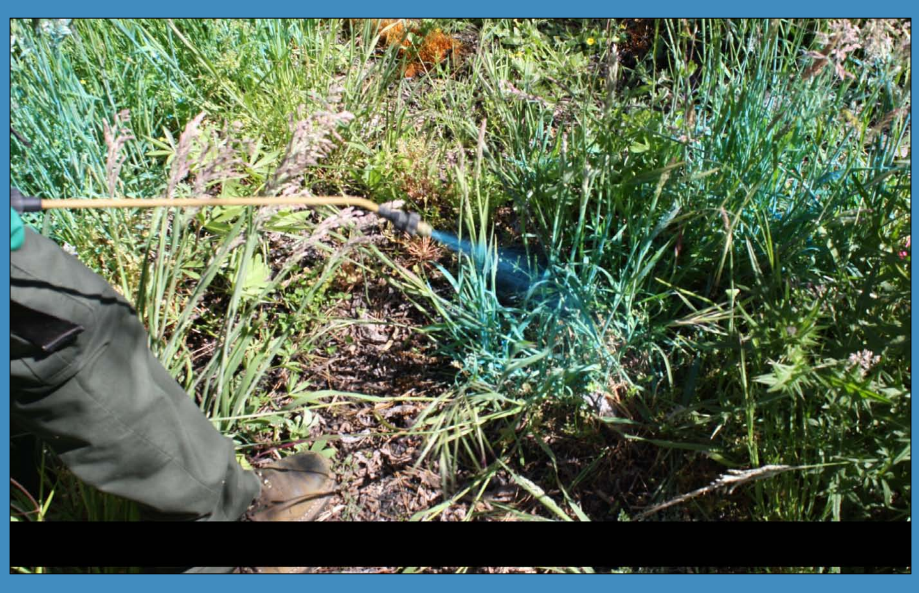
Daniel Bracken spot-sprays velvet grass with a 2% glyphosate solution. Blue indicator dye helps show where the herbicide has been applied.

A solution of only 0.5% Agridex surfactant applied to velvet grass shows that this standard concentration is far too low. Because the foliage is covered with velvety hairs, a 2% surfactant solution is needed.