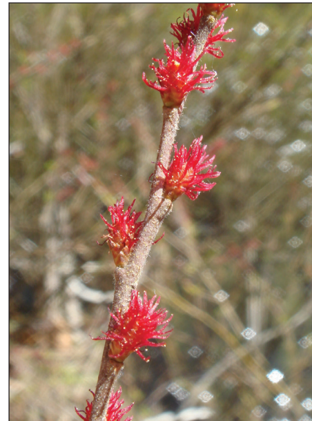
Sierra sweet bay