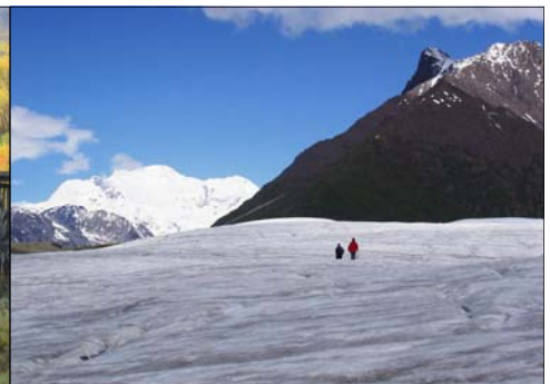
Hiking Root Glacier