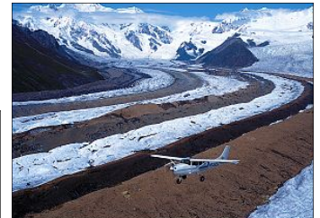
Above the Kennicott Glacier

Based in McCarthy, Wrangell Mountain Air provides three scheduled flights between Chitina and McCarthy on a daily basis. For further information phone 1-800-478-1160, email info@wrangellmountainair.com , or online www.wrangellmountainair.com .