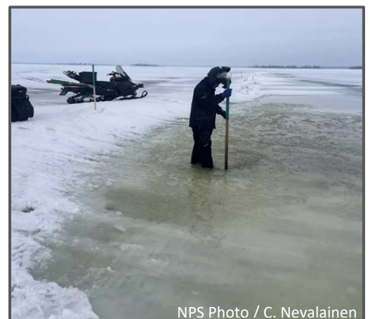
Maintenance worker Jason Christenson inspects a pressure ridge on Kabetogama Lake that resulted in over one foot of standing water on top of the frozen lake surface along the green snowmobile trail.

PLEASE NOTE: All snowmobile trails are now temporarily closed following recent rain and warm weather. Trails will reopen if and when the weather allows. View the most recent Winter Trails Report on our website.