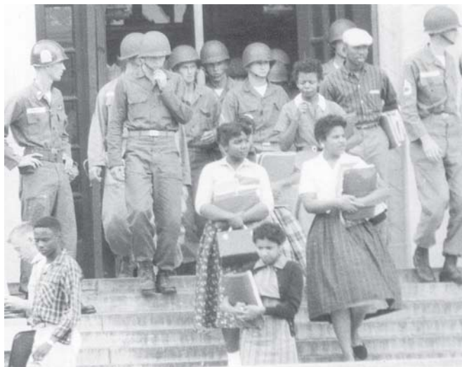
The Little Rock Nine leave Central High School under federal troop escort.

Ella Baker Southern Christian Leadership Conference