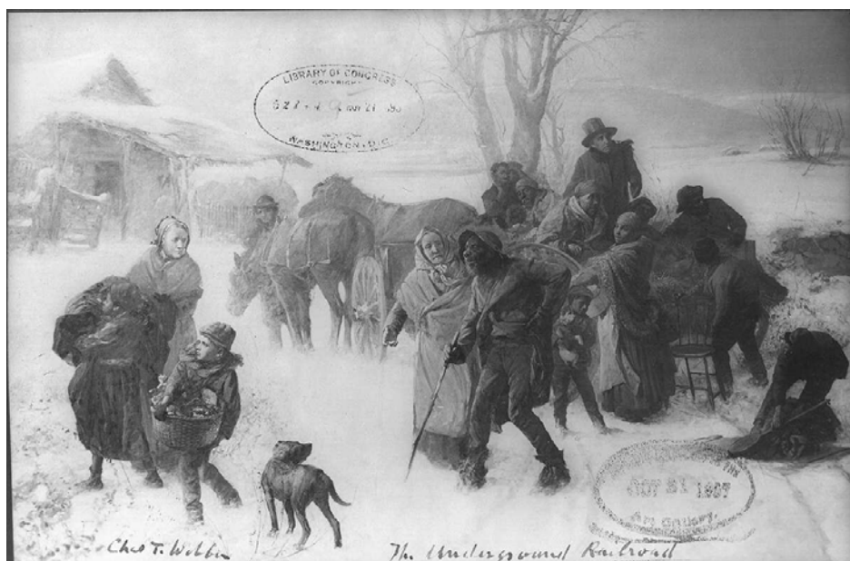
The Underground Railroad, 1893 Reproduction of a Painting by Charles T. Webber. Original in the Cincinnati Art Museum.