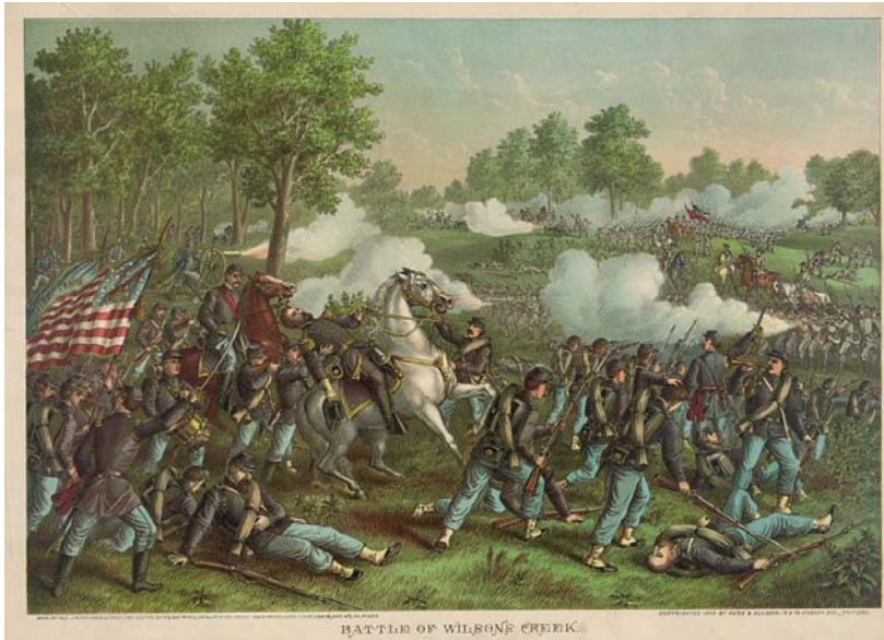
Battle of Wilson's Creek, August 10, 1861.

their loyalties to family and country. The August 10, 1861 battle of Wilson's Creek, the second major engagement of the Civil War, left the victorious southern forces too weak to recapture the state, ultimately securing Missouri for the Union although guerrilla and military fighting in the state would continue throughout the war. Federal control of Missouri placed the state's natural resources at the disposal of the North and provided President Lincoln a "gateway" for integrating the west as free agrarian land to fuel a national industrial economy.