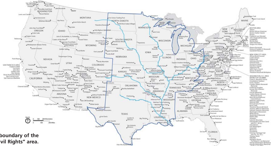
Map showing boundary of the "Civil War to Civil Rights" area.