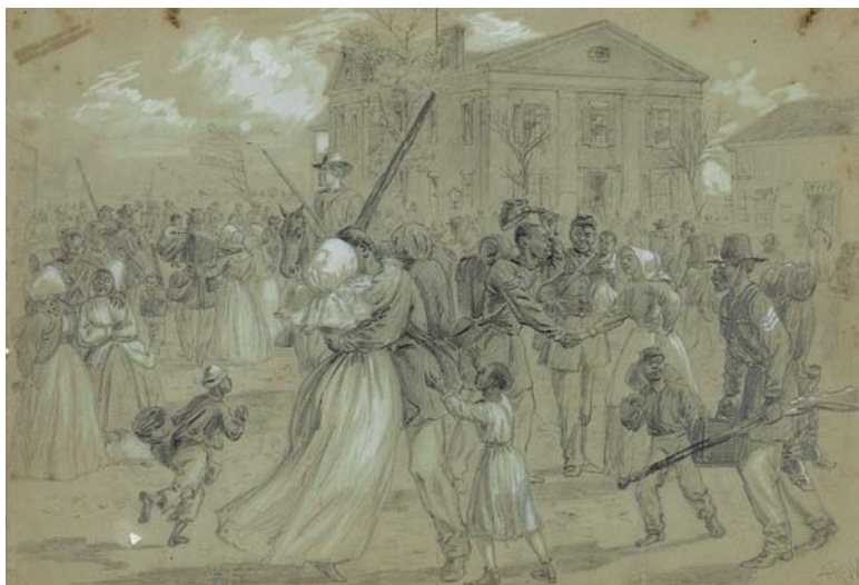
U.S. Colored Troop soldiers mustering out at Little Rock, Arkansas.