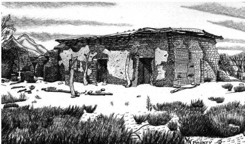
Ruins of the Calabazas Mission church

Bathroom facilities are available only at the beginning and end of the day at Tumacácori, and at the lunch stop.