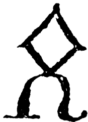
Pacheco "Diamond Bell" Brand

Three Missions Living History Tours Tuesday, January 12, 2010, 10:00 - 3:30 Tuesday, February 9, 2010, 10:00 - 3:30 Tuesday, March 9, 2010, 10:00 - 3:30 Tuesday, April 13, 2010, 10:00 - 3:30