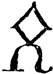
Pacheco "Diamond Bell" Brand