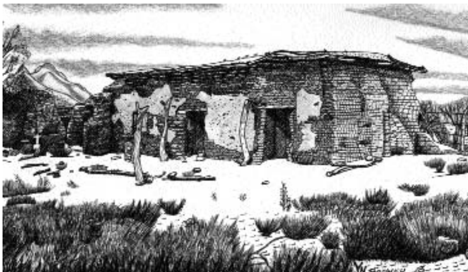
Ruins of the Calabazas Mission church

accessible. There is some walking on uneven terrain at each site, with one short, rough, uphill section of trail. There is NO SEATING available along the trails. There is no shade or shelter, except at the lunch stop. You must be prepared for the weather. Bathroom facilities are available only at the beginning and end of the day at Tumacácori, and at the lunch stop.