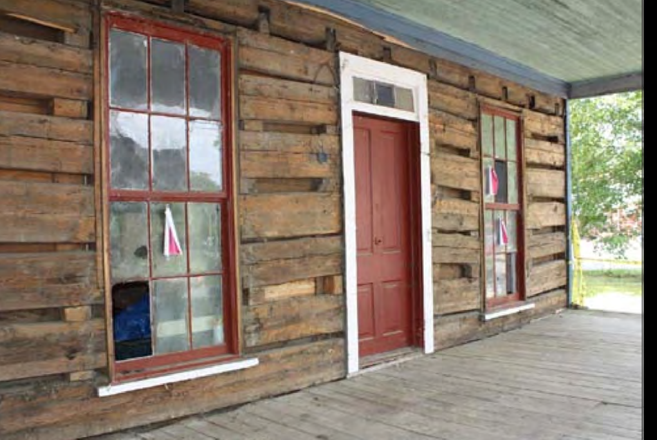
The Green Hotel, in front of you, contains within it an original log structure that predates Cherokee removal, possibly as early as 1810.