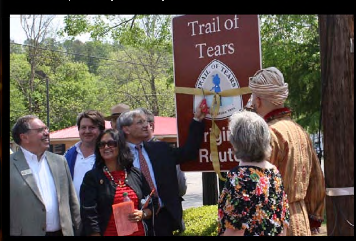
This Cherokee delegation visited Cave Spring in 2011, recognizing its connection to the story of removal. The structure is located on an original route of the Trail of Tears National Historic Trail.